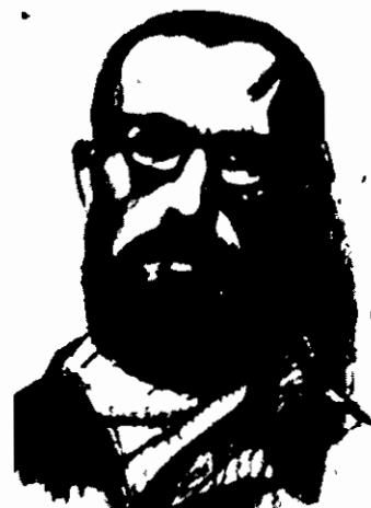
YURI GALANSKOV 6 years later