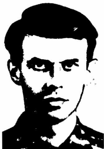
YURI GALANSKOV before arrest

He was buried that same day in the village of Barash-evo, opposite the camp hospital. Officials permitted a cross to be set above the grave, instead of the usual numbered grave marker.