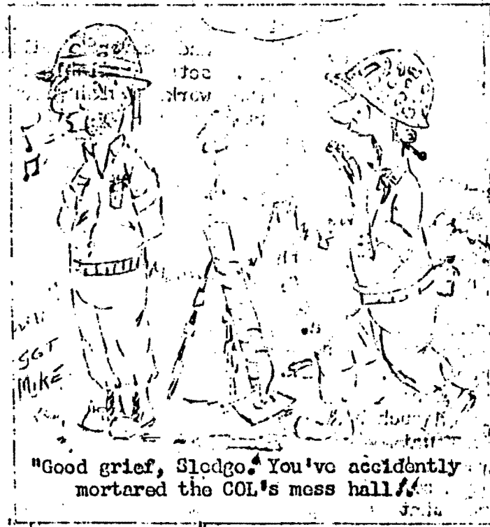
"Good grief, Sledge. You've accidentally mortared the COL's mess hall."

Infantrymen from the 3rd of the 1st captured the son of a VC cadre-member in a rice paddy near here.