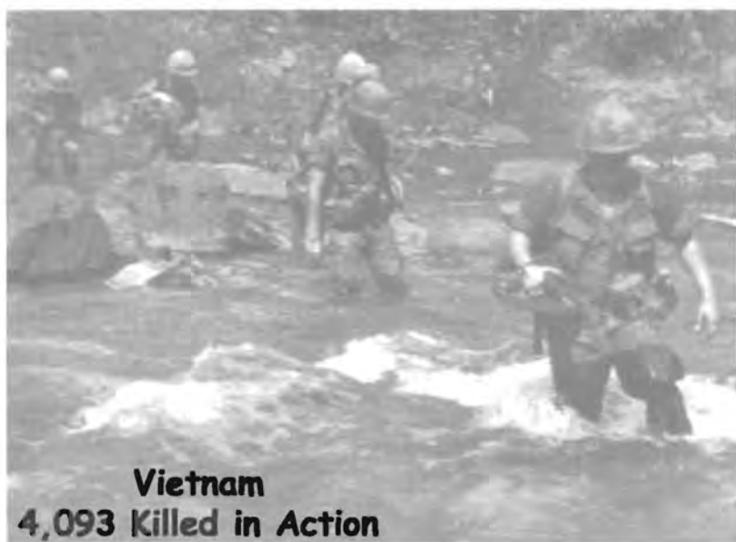
Vietnam 4,093 Killed in Action