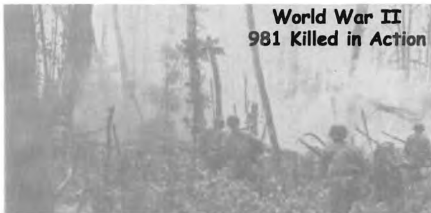
World War II 981 Killed in Action

We remember our fallen brothers, their sacrifice for our country and for their lives unlived.