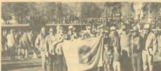
GATHERING OF THE "Burning Worms" 196 LIB