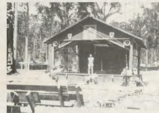
STAGE ON BOUGAINVILLE

When some of the older boys left for home I was fortunate enough to be put in charge of the Post Exchange on Leyte and I held that position the of the time including the time we spent in Japan.