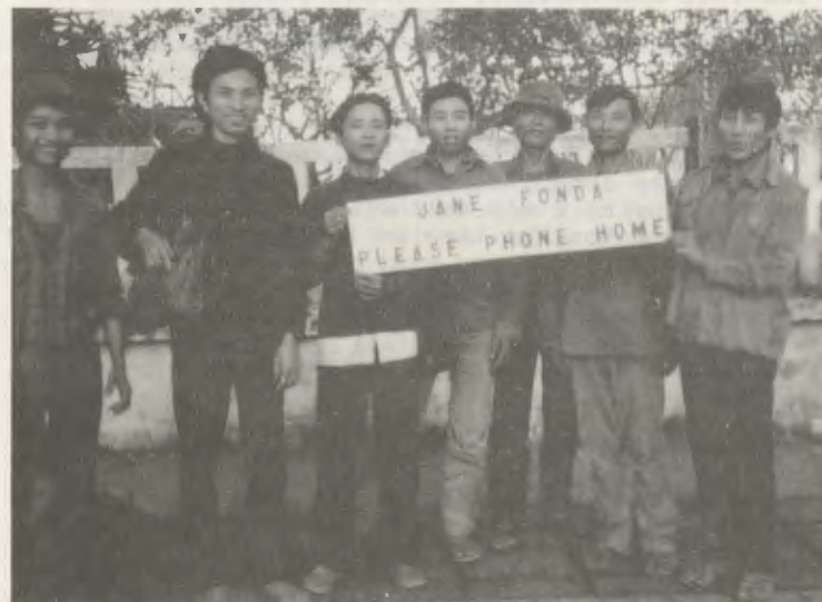
"HUE" SAME IF YOUR OUT THERE PLEASE PHONE HOME THEY NEED YOU