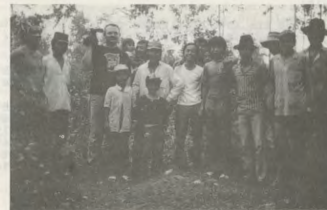
HELO PAD 1-52 198TH INF LZ BAYONET 'MIDDLE of HELO PAD

11 Woodview Dr. Lake St. Louis, Mo. 63367 (314) 625-1662 1/52 198th Inf. Americal July 68 - Sept 69