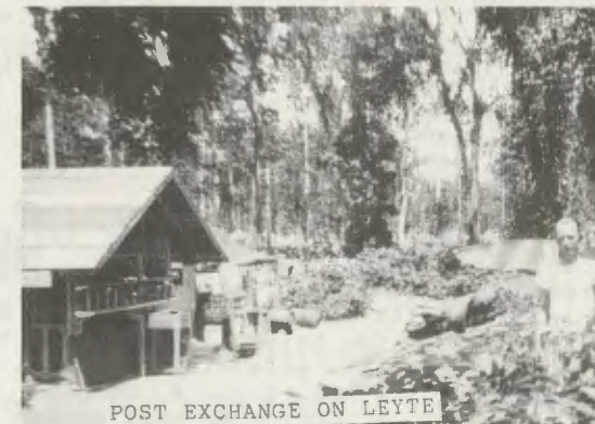
POST EXCHANGE ON LEYTE