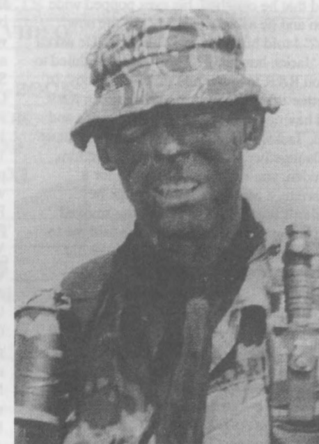
"Men with Painted Faces", An Americal LRRP