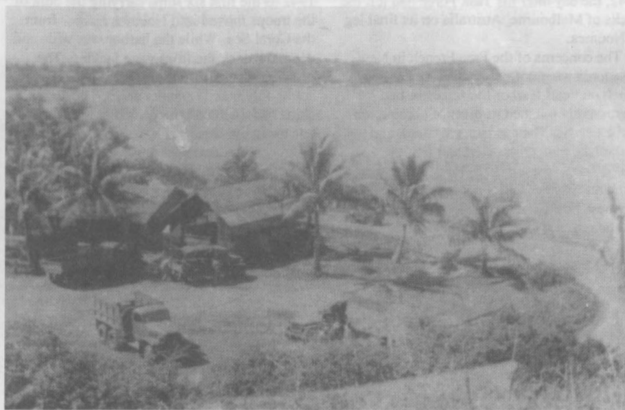
Headquarters Battery, 70 th Coast Artillery, Outside Noumea, New Caledonia

Relationships between the American troops and the French "colonials" were on and off depending on location, events and circumstances. After one month in New