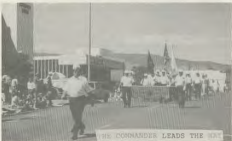
THE COMMANDER LEADS THE WAY