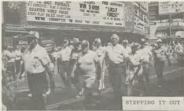
STEPPING IT OUT