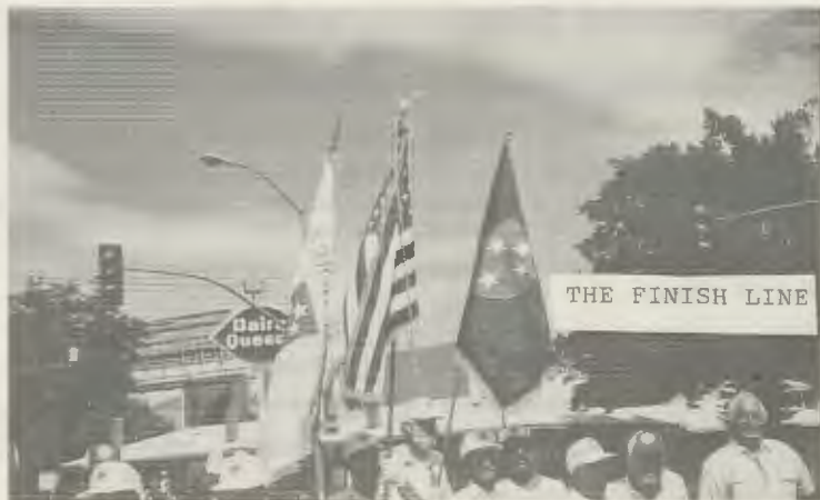
THE FINISH LINE