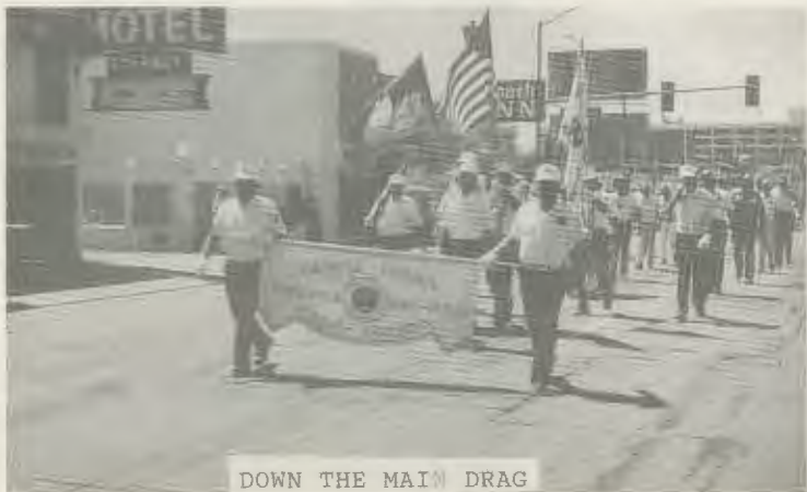
DOWN THE MAIN DRAG