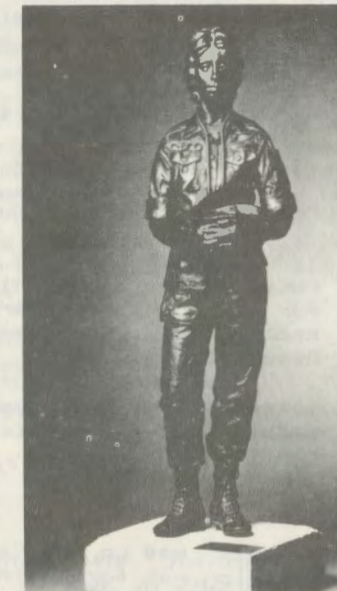
Women's Statue . . .

I urge you to contact your elected representative and voice your approval or disapproval.