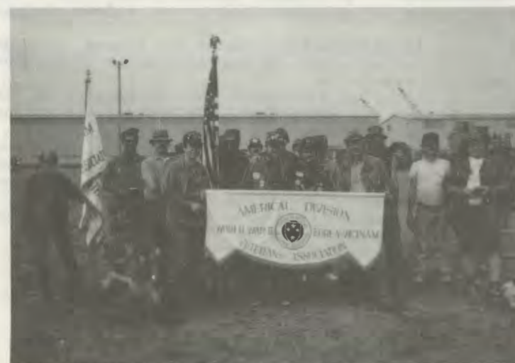
FIREBASE CLEVELAND

THE 196TH LIB LOCATE-A-BROTHER 1989 REUNION June 23, 24, 25, 1989 Marriot at the Airport St. Louis, MO.