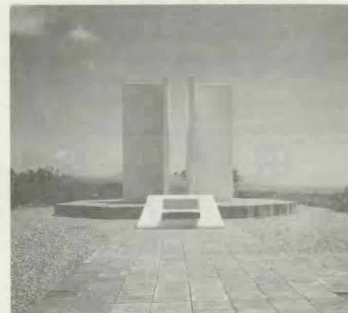
JAPANESE MEMORIAL MOUNT AUSTEN GUADALCANAL