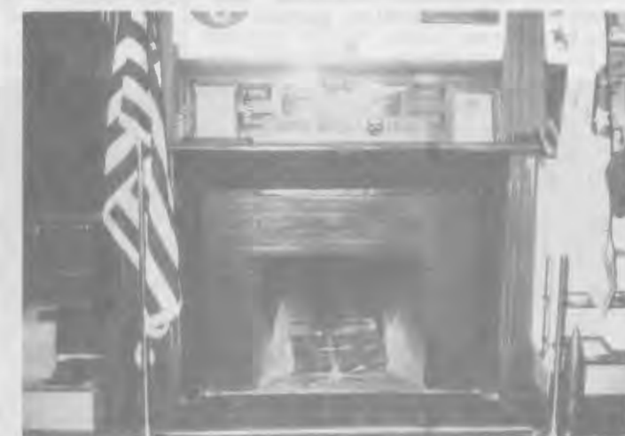
FIREPLACE IN THE MAIN ROOM

Display cases were being cleaned and stocked with artifacts from the cartons that had been stored since the move from Fort Devens. The Roll of Honor and the Medal of Honor plaques have been hung over the fireplace as a central exhibit. One end of the large room, some 30' x 39', has a wall of display cases, probably an old rifle cabinet 24 feet long, with drawers beneath and room above to display other pieces such as the large display of model planes, ships and so forth, which never were appreciated in our former museum.