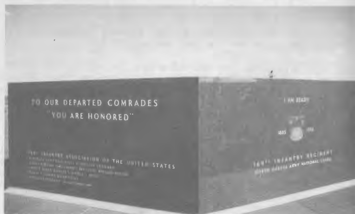
REAR VIEW OF THE MONUMENT NORTH DAKOTA VETERAN'S CEMETERY