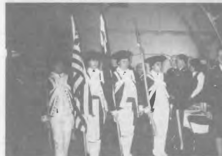
MASSACHUSETTS NATIONAL GUARD CEREMONIAL UNIT