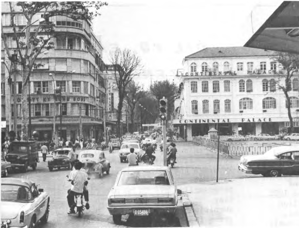
TU DO Street One of Saigon main streets