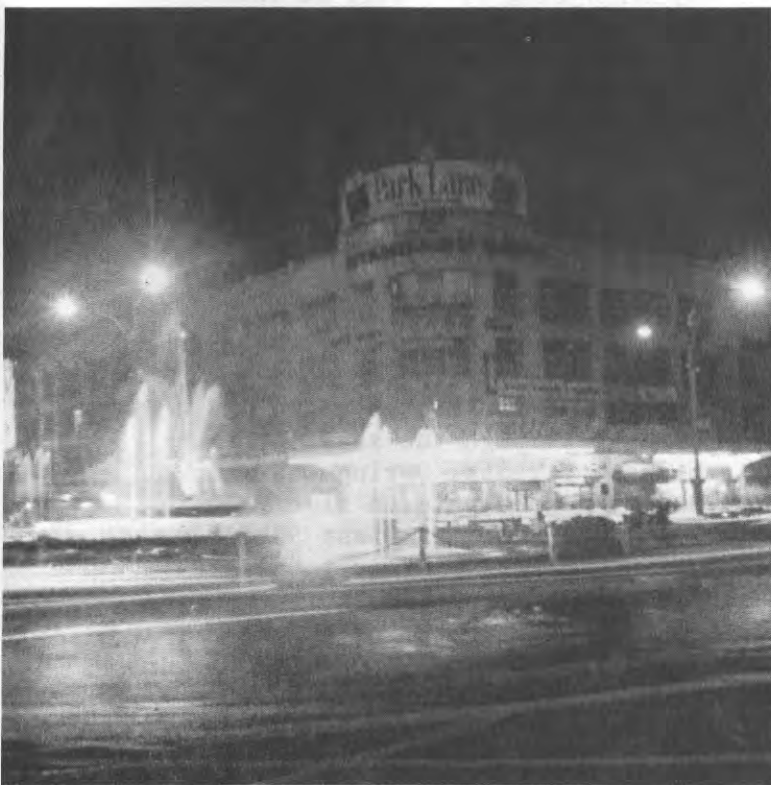
SAIGON by night