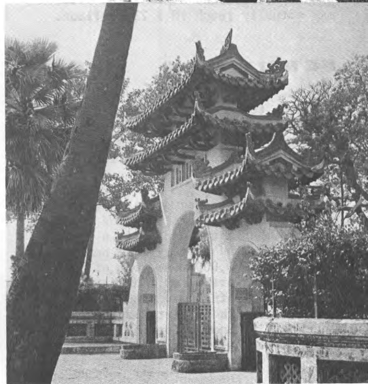
Marshall LE VAN DUYET Temple named after the first Governor of Saigon Area