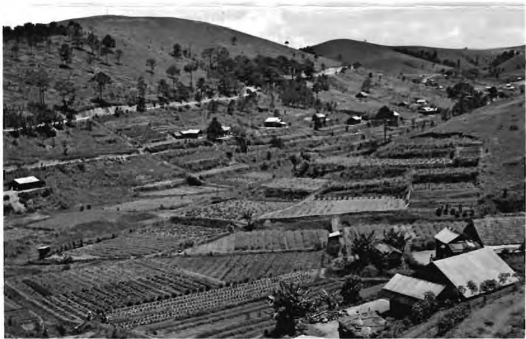
VIET NAM COUNTRYSIDE