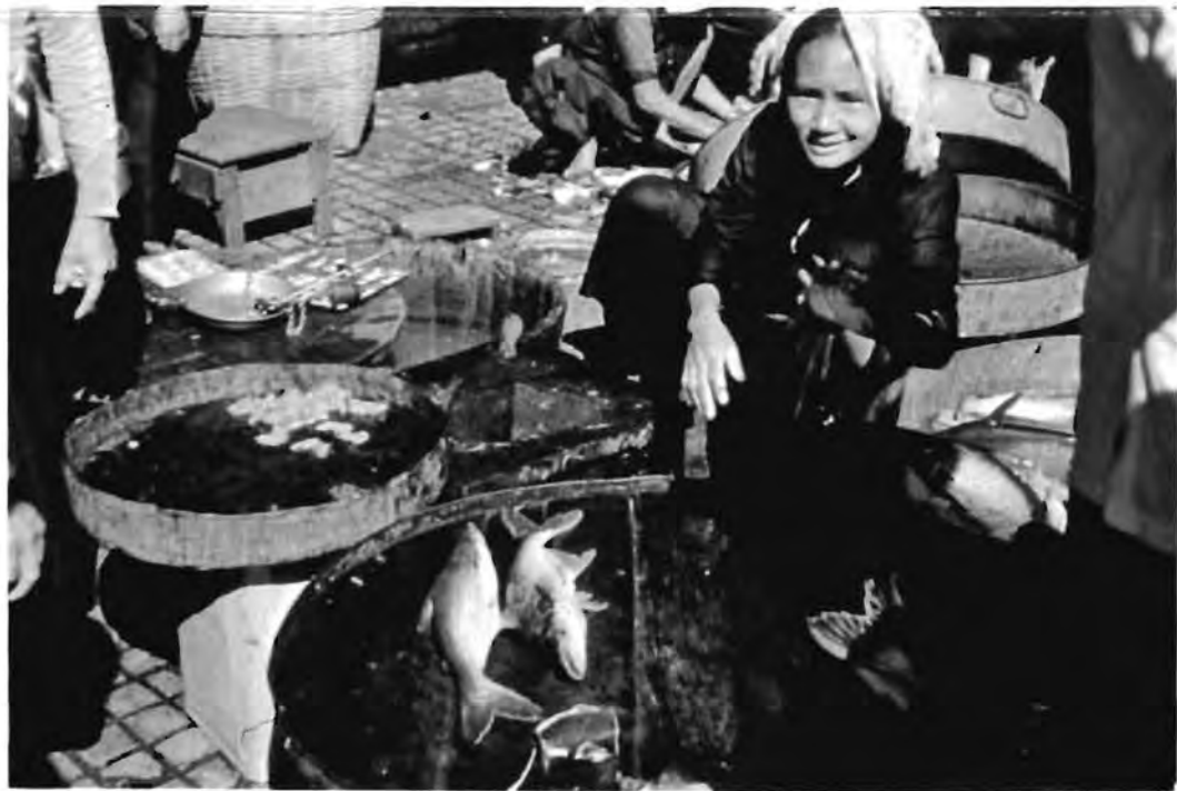
PRODUCE MARKET, SAIGON