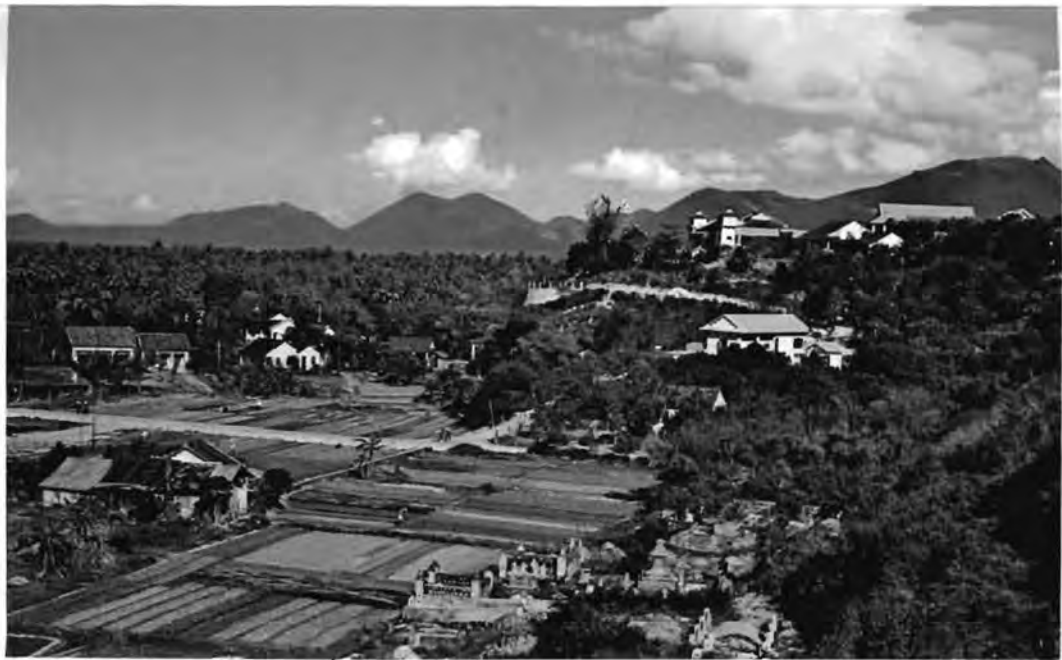
NHA TRANG, SOUTH VIET NAM