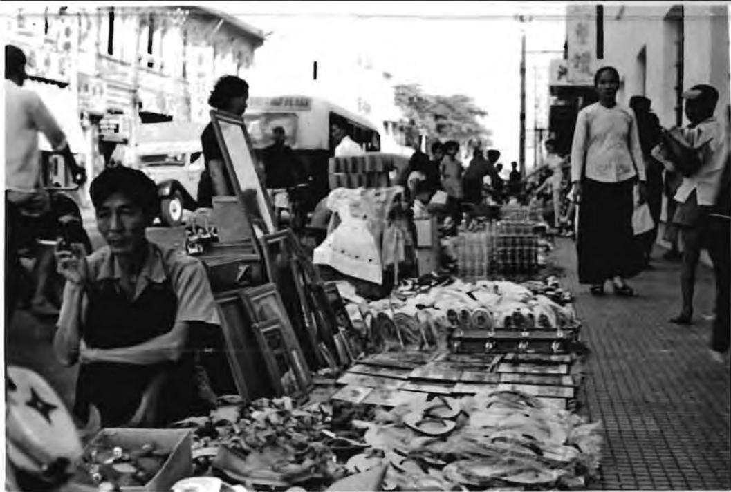
SIDEWALK MARKET, SAIGON