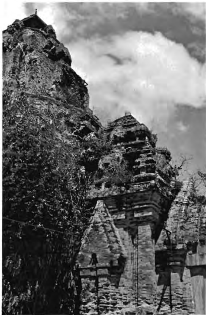
TEMPLE RUINS, NHA TRANG