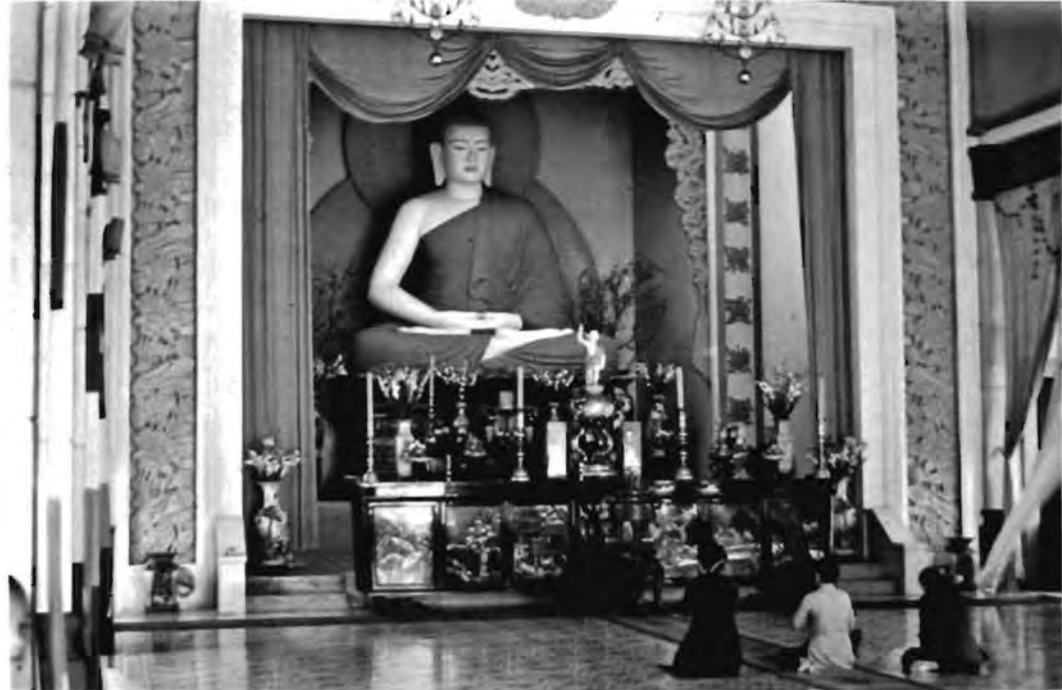
BUDDHIST TEMPLE, SAIGON