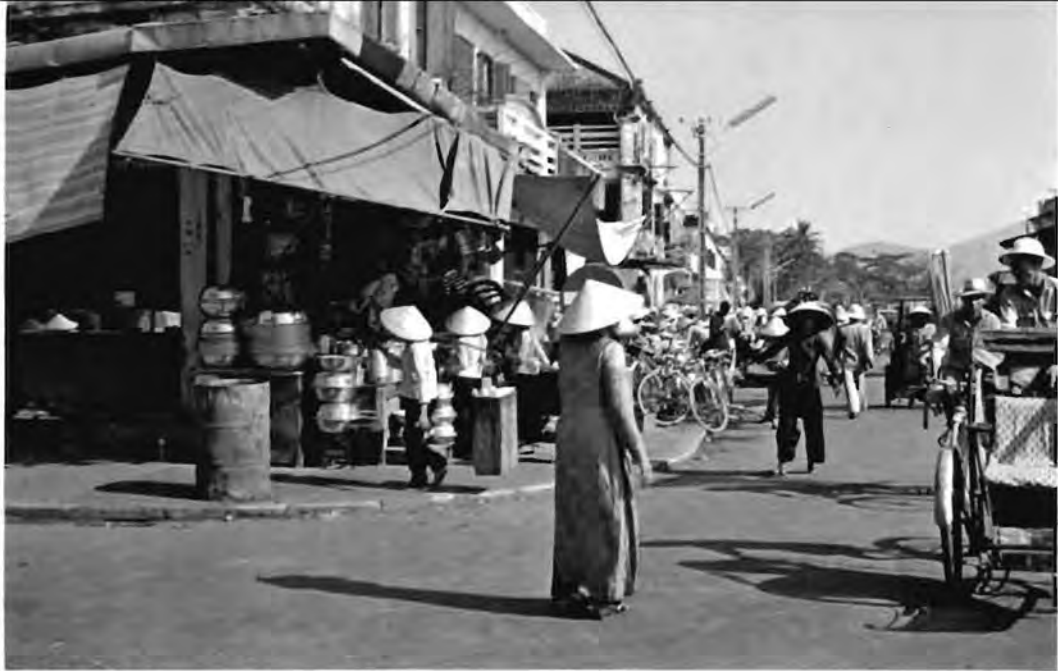
MARKET PLACE, DA NANG