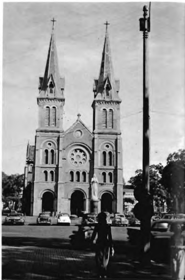
CHURCH OF HOLY HEART, SAIGON