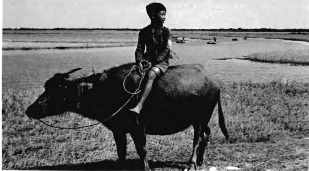
BOY ON WATER BUFFALO, VIET NAM