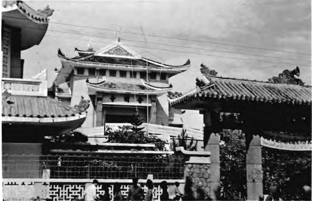
CHUA XA LOI PAGODA, SAIGON