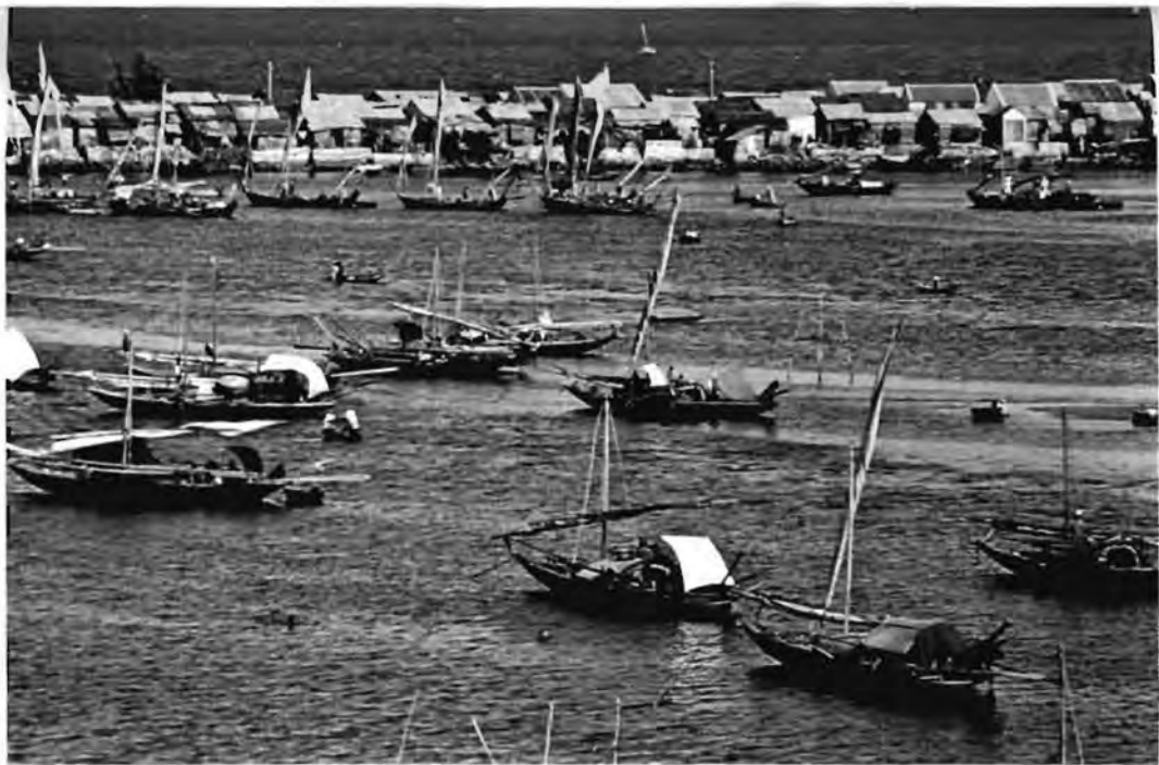
RIVER PEOPLE, VIET NAM