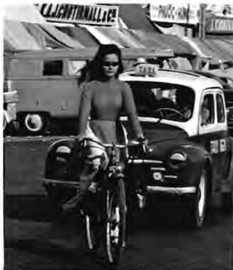
A VIETNAMESE BEAUTY

The climate is a tropical rainy climate with warm temperatures. Rainfall is heavy primarily in the summer months while winters are dry but still warm. It is mostly a mountainous country and very rugged except for the coastal plains.