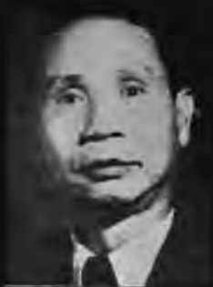
Tran Nam Trung—Born in North Vietnam in 1913, Tran is a militant revolutionary. He is formerly an NVA officer, but is now secretary general of the People's Revolutionary Party, which claims to represent the South Vietnamese people.

THE situation was becoming critical in South Vietnam. The Diem Government asked for increased U.S. assistance in October 1961. The American government responded immediately.