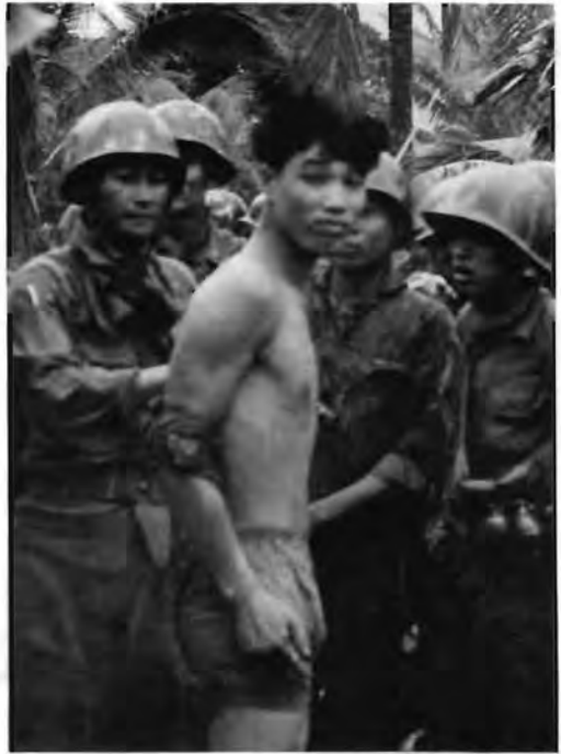
A hard core Viet Cong soldier is taken into custody by Vietnamese Army Rangers (right). South Vietnamese forces under attack by VC unload supplies from a U.S. helicopter in early days of the conflict (below).