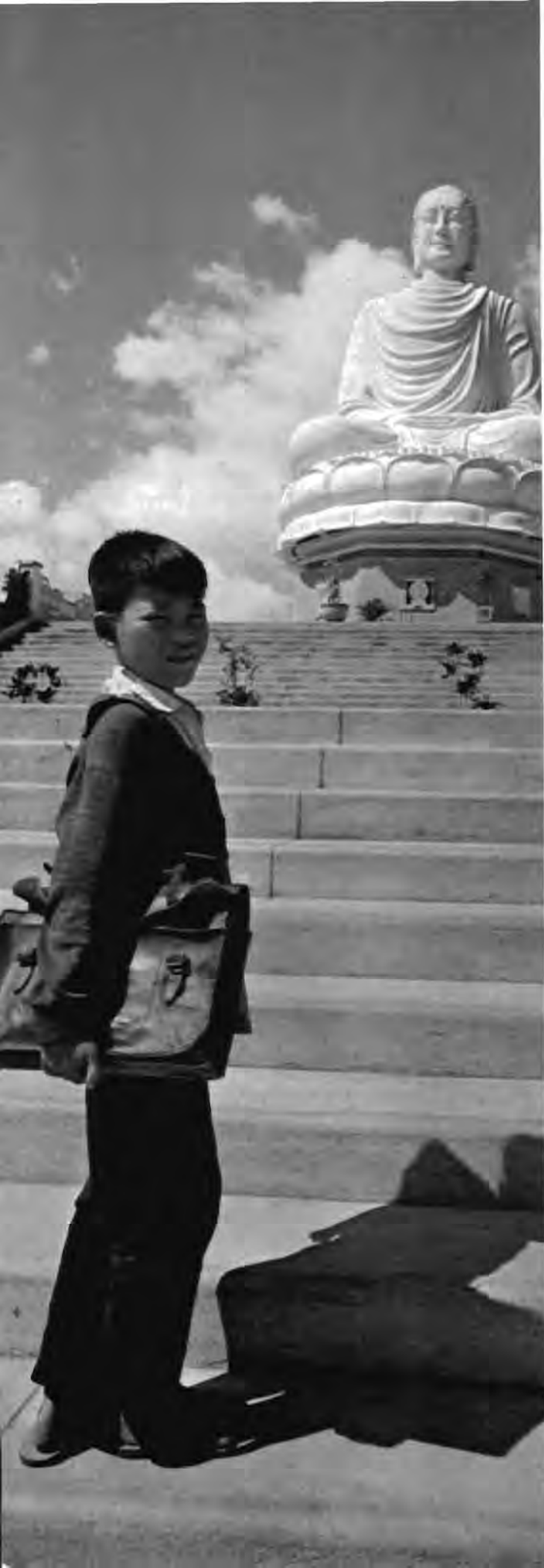
A giant Buddha overlooks a Vietnamese youngster and the harbor at Nha Trang.