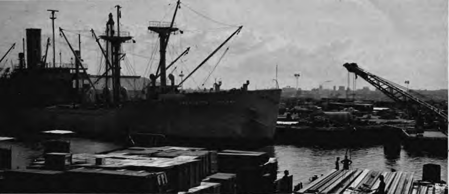
The American buildup in South Vietnam required huge amounts of supplies and equipment. Saigon port was a major unloading point.