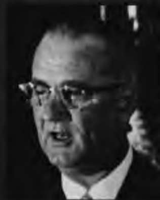
President Johnson requested and received the consent of Congress to use armed force to protect Southeast Asia.

Thus, with aggression met by resolve, the darkest era of South Vietnam's history drew to a close. America, joined by other SEATO countries, would respond to South Vietnam's call for assistance.