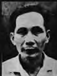
Vo Chi Cong—Born 1921 in Quang Nam Province, Vo Chi Cong joined the Communist revolutionaries in his teens. He is one of the major founders of the National Liberation Front and probably a key figure in the People's Revolutionary Party—yet he is a relative unknown.