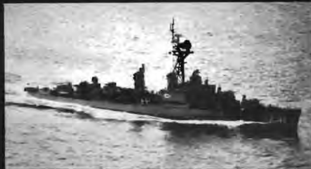
The USS Maddox (above) was attacked off the coast of North Vietnam on Aug. 2, 1964, thus leading to the Tonkin Resolution. An Army sergeant aids a wounded Vietnamese child during a savage VC terror attack (below).