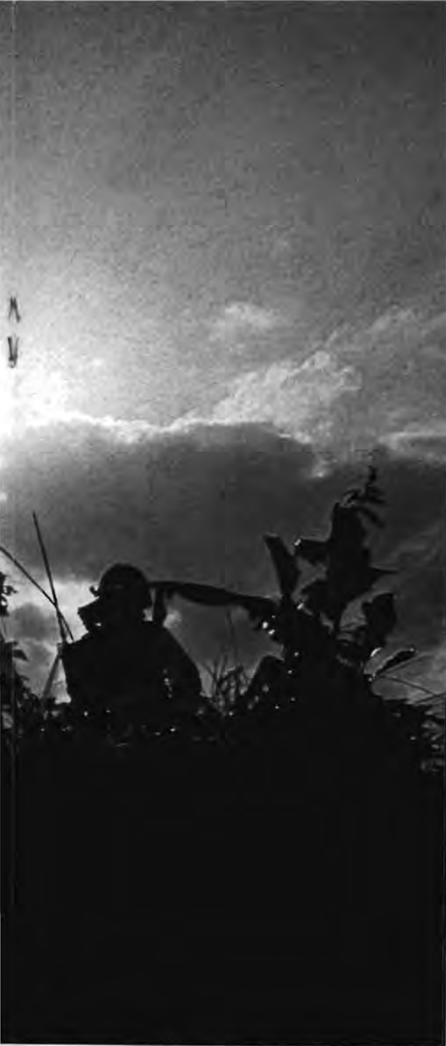
Armor and air support