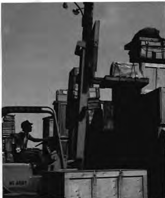
Logistics personnel "humped" supplies from docks to depot and then to the field.

80 tons of arms and ammunition was sunk at Vung Ro Bay.