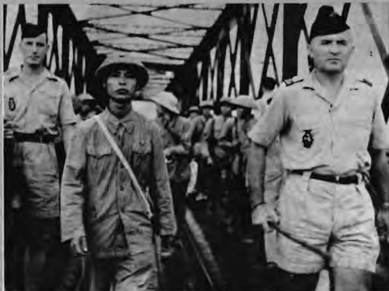
The stern faces of victor and vanquished are shown, shortly after the fall of Dien Bien Phu (above). The Geneva Conference opened in April 1954. Participants included Communist China, Laos, Cambodia, South Vietnam and North Vietnam (below).

non-Communist society. In the North Ho Chi Minh was busy organizing a Communist state which would be the base for the realization of his ultimate dream of a unified Communist Vietnam.