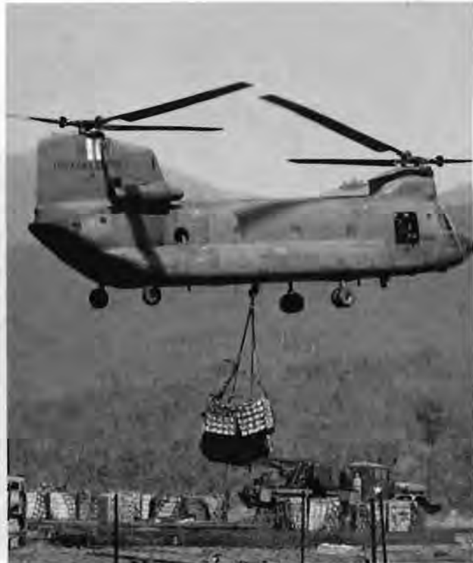
Aerial resupply is one of the jobs performed by the Chinook helicopter, carrying goods either inside or by sling load.

The buildup continued in June with the arrival of Australia's first combat troops, the 1st Battalion, Royal Australian Regiment. U.S. combat engineers arrived in force to begin the construction of a deepdraft port and airfield at Cam Ranh Bay.