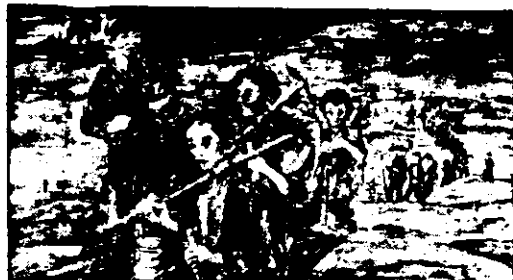
Bich Thuy — Special to the Mercury News

These drawings illustrate the brutal treatment of inmates at the re-education camps. The painting above is an artist's depiction of a work detail, based on former prisoners' descriptions. At left, a survivor's sketch shows a man shackled around a post in a "punishment hole."