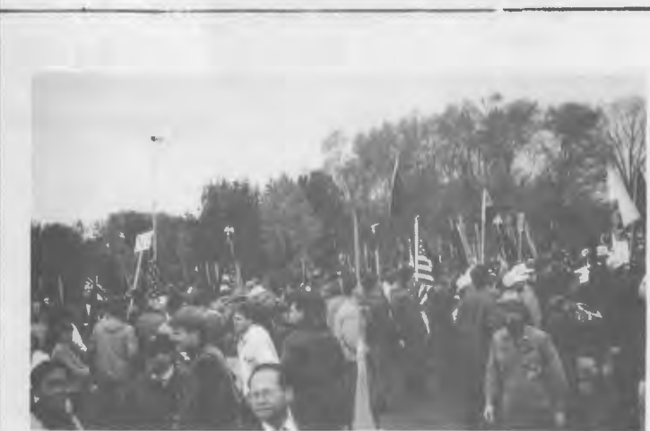
PHOTO'S FROM WASH, D.C. - NOV 1992