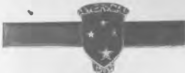
ADVA Tie Bar