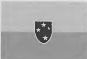
Americal Divisional Flag