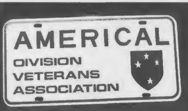
ADVA Car Plate