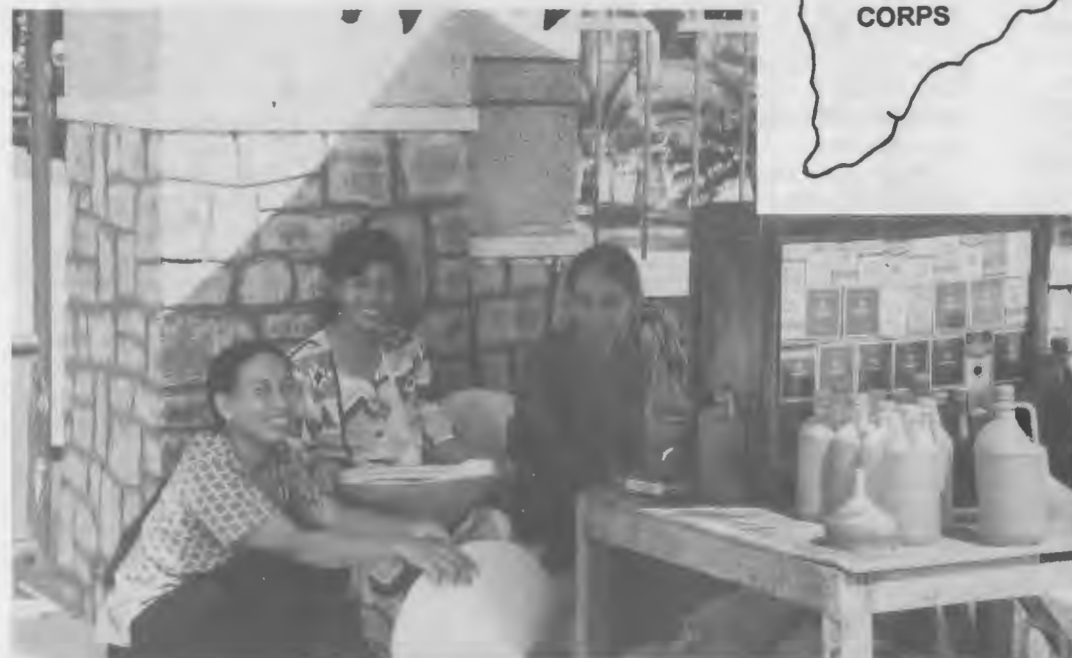
(Right) Roadside refreshment stand along Highway #1, with fresh fruit, juice, coke, and cigarettes.