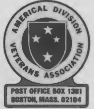
ADVA Window Decal