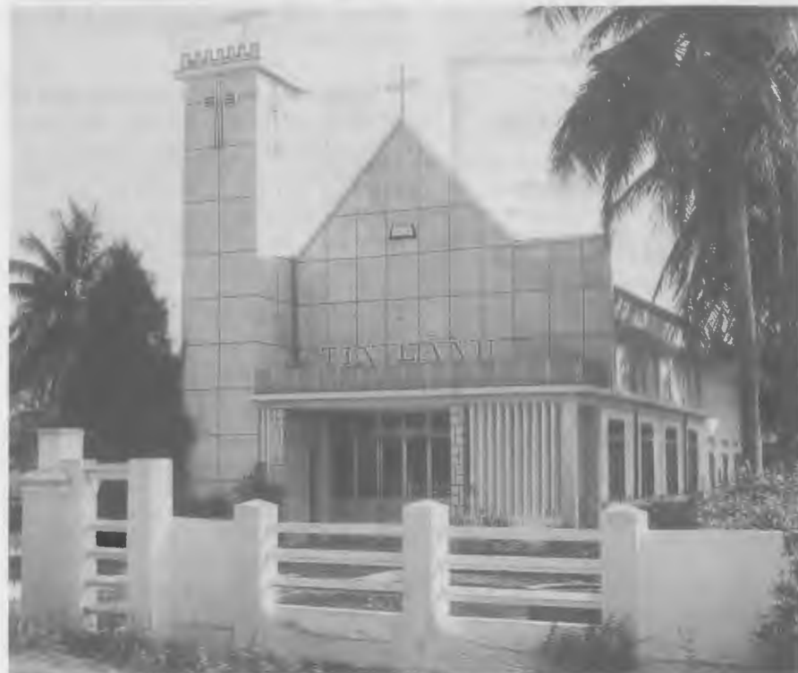
(Above) Catholic church just North of Chu Lai. Catholic churches, large and small, are seen throughout Vietnam.