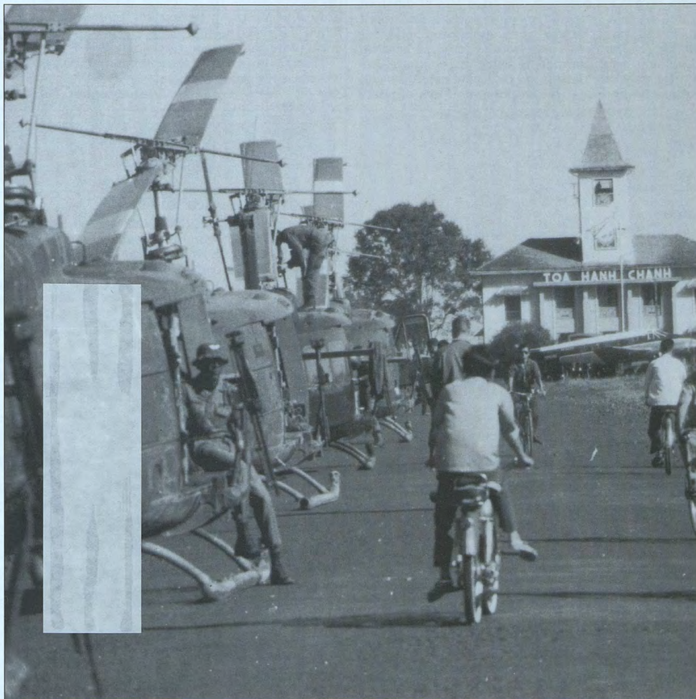
UH-1D slicks are parked on a road leading to province headquarters in Song Be, South Vietnam, in 1967.