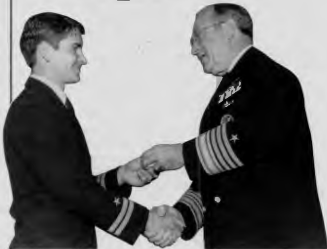
Naval Institute essay and photo contest winners are honored by the Chief of Naval Operations.

Awards. The Naval Institute's commitment to excellence starts with our nation's future naval leaders. Each year several outstanding students from the U.S. Naval Academy, OCS, AOCS, all NROTC Units, and each NJROTC area are rewarded for their scholastic and leadership performance. The awards include USNI memberships, books, and letters of congratulations from the current Chief of Naval Operations. Awards are also given to the outstanding students of select international naval academies.