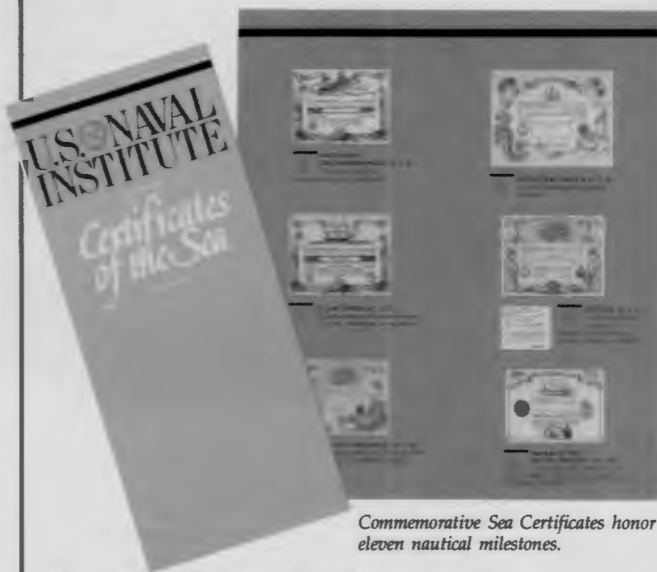
Commemorative Sea Certificates honor eleven nautical milestones.

Over 35,000 photographs are available for purchase and all photos are available for research. USNI members receive a 25% discount on their photo purchases.