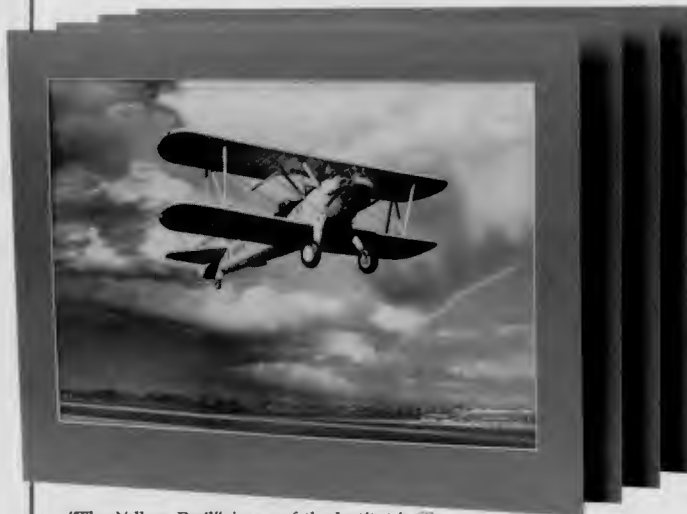
"The Yellow Peril" is one of the Institute's 60 full color prints.