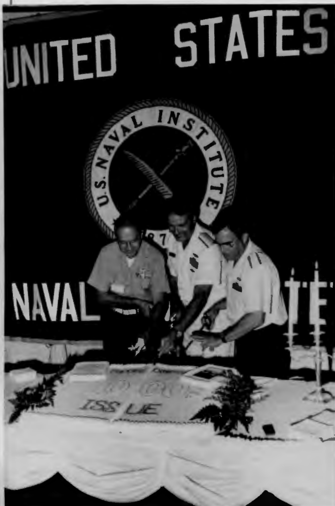
Proceedings celebrated its 1,000th issue in June, 1986 (above) while the USNI reached a milestone of 100,000 members in 1987.

and the Naval and Maritime Photo Contest, which is co-sponsored by Kodak. Winners of the essay contests win cash prizes and medals. The first place essays are published in Proceedings . The photo contest winners receive cash prizes, and the prize-winning photos are published in Proceedings . Awards for these contests are presented at the Naval Institute's Annual Meeting. Throughout the year additional essay contests on special topics are sponsored in order to stimulate thinking on vital issues. Our motto, "to advance knowledge," is put into action as hundreds of professionals participate in these contests each year.