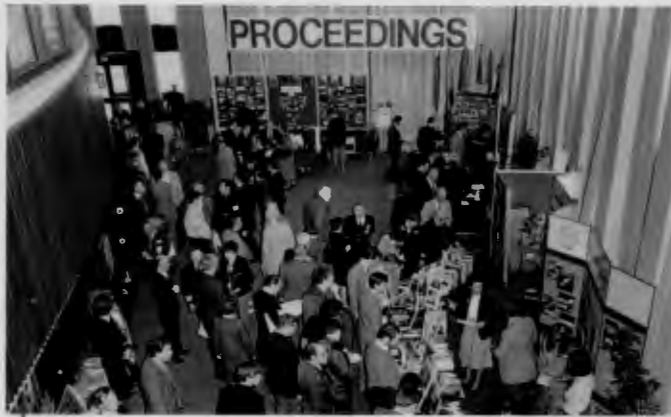
Members have an opportunity to meet other USNI members, authors, Board members, and staff at the USNI Annual Meeting.

Each year the meeting location is rotated to give members across the country an opportunity to attend. The three locations where the Annual Meetings are held are Newport, RI; Annapolis, MD; and Monterey, CA. All USNI members, Regular and Associate, are invited and encouraged to attend this annual event.