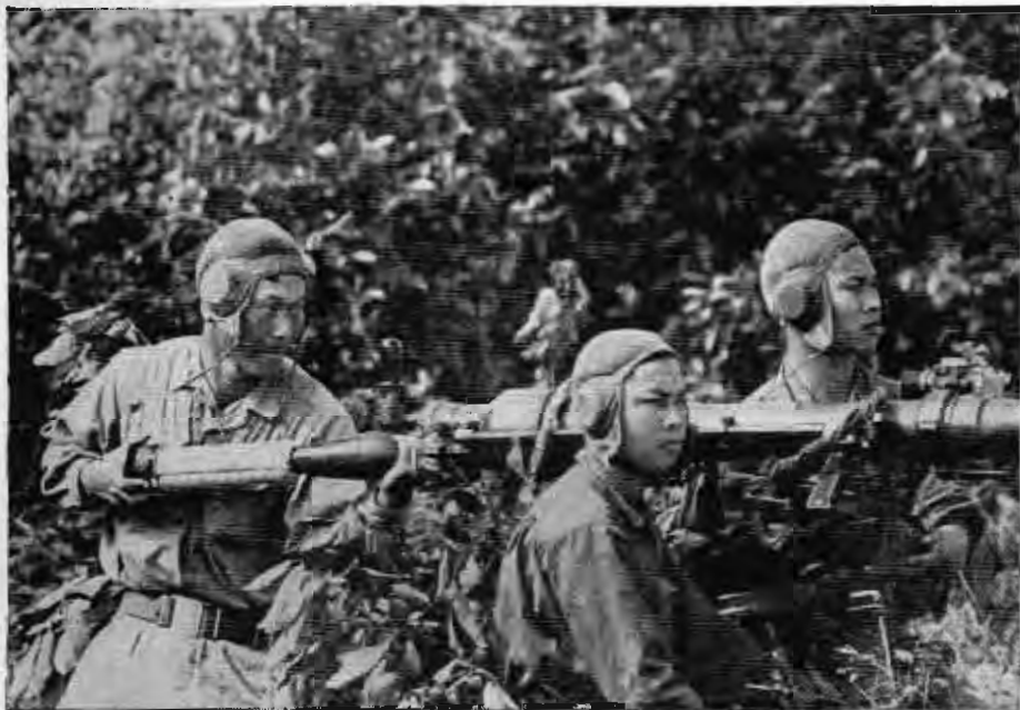
L. A. F. artillery in action