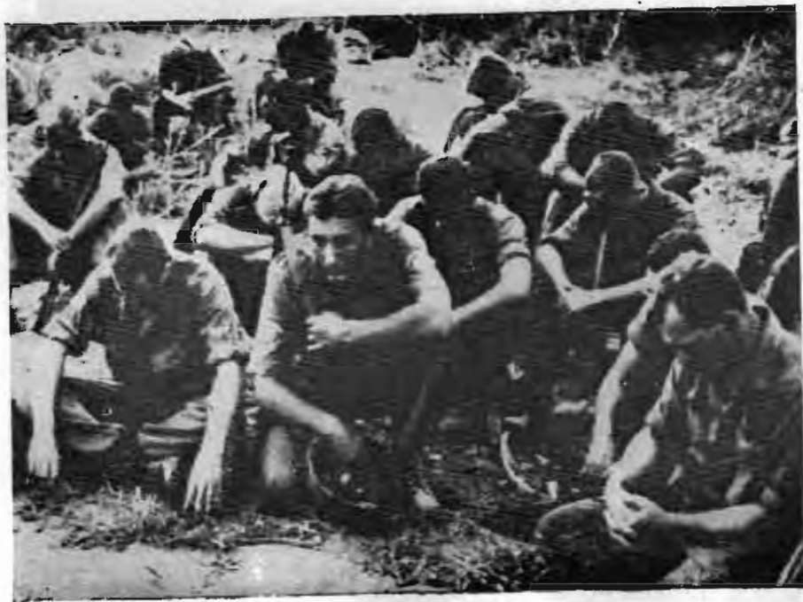
The G.I.'s after an engagement with the L.A.F.