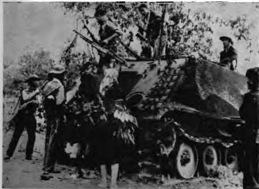
An M. 113 armoured car captured by the guerillas of Cu Chi village, Gia Dinh province