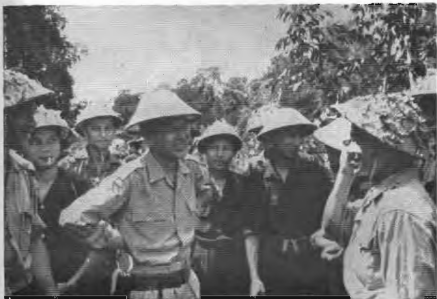
Visit to the combatants by Dr Nguyen Huu Tho, President of the Central Committee of the National Front for Liberation