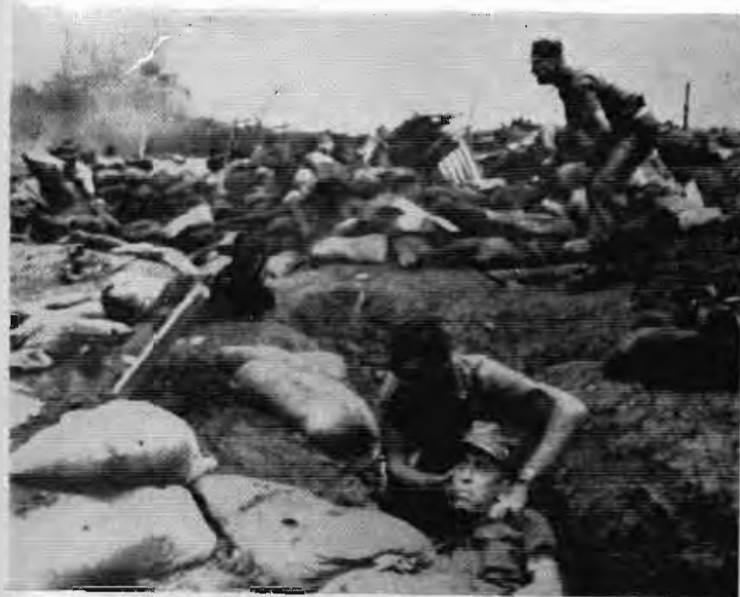
U.S. position at Con Tien, Quang Tri province, shelled by L.A.F. mortars