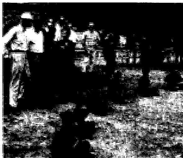
VIET-NAM REVOLUTIONARY DEVELOPMENT. Vice President Humphrey and Ambassador Ellsworth Bunker observe young Vietnamese boys being taught national songs at the Vung Tau National Revolutionary Development Center. The Center has graduated more than 30,000 young rural men and women who have gone into hamlets threatened or controlled by the Viet Cong to assist the local people in resisting Communist intimidation. The Vice President flew from Saigon where he was attending the October 1967 inauguration of President Thieu.

4. Efforts to initiate a peaceful settlement. From the outset of the war in Viet-Nam, the United States has tried to move from the battlefield to the conference table. President Johnson often has offered talks without preconditions. Hanoi's response until May 3 was to demand preconditions of its own. The U.S. response, in effect, has been: If Hanoi demands such a precondition as a halt to the bombing, the United States has a right to ask for assurance that Hanoi will not take military advantage of such a halt. Moreover,