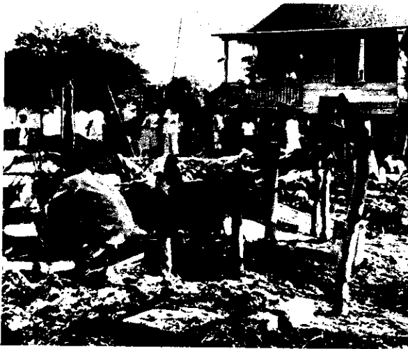
PHILIPPINES. Townspeople search the wreckage of their homes after a Communist-led Hukbalahap guerrilla raid on Luzon Island August 25, 1950. Guards ringed Manila after a weekend of terror by the Huks left a death toll of 85 persons in nearby communities.

excuse for a war of national liberation by giving the country its independence under a democratically elected government.