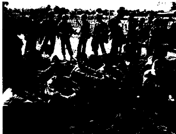
'LAOS. Lao soldiers guard North Vietnamese Regular Army soldiers after their capture in Thakhek, Khammouane Province. The Vietnamese soldiers were guarding a cave containing Communist Chinese-manufactured weapons and supplies.

Soviet foreign policy has been complicated by the ideological divisions which