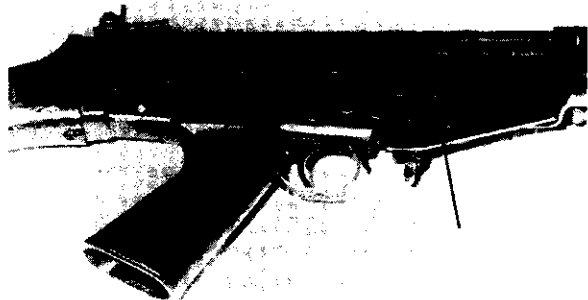
VENEZUELA. Three tons of buried weapons and ammunition found on November 3, 1963 on a Venezuelan beach were traced to Cuban origin. Cuba is the only country in the Western Hemisphere equipped with the 7.62 mm. rifle shown above, which was part of the arms cache. The arrow points to the hole left by the removal of the Seal of Cuba normally engraved there.

3) Conflicts where Communist participation, for a variety of reasons, remains minimal.