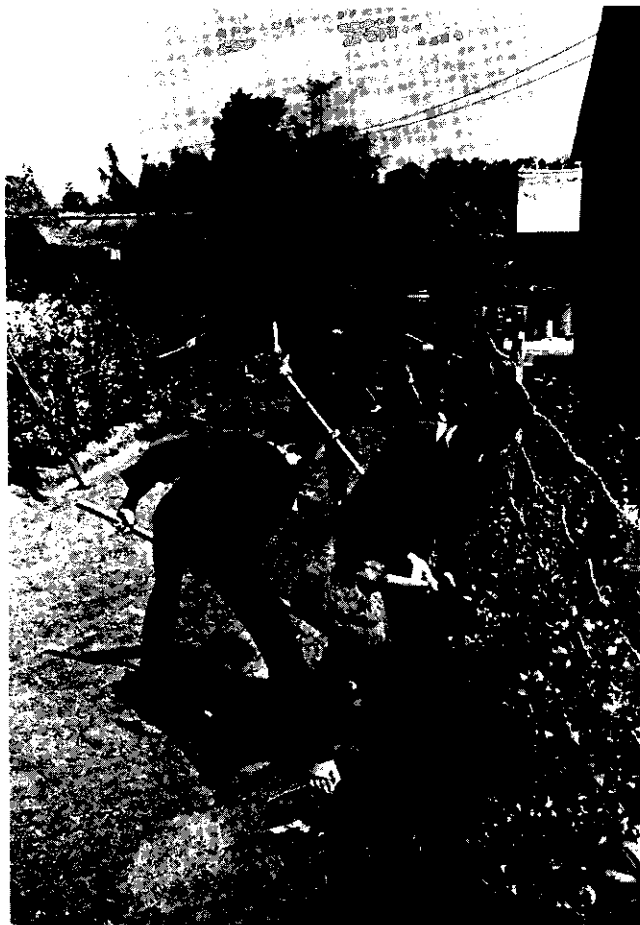
Revolutionary Development team workers assigned to this secure hamlet help dig drainage ditches along the roads after installing barbed wire around the houses.

The rural policeman on his remote hamlet beat, or the ARVN medic bandaging a villager's