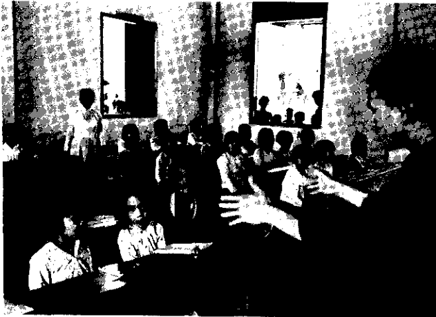
Revolutionary Development team members not only help to build schools, they also assist in the educational process.

ganizes citizen groups, and improves local government. The remaining section assists village officials in the implementation of development programs.