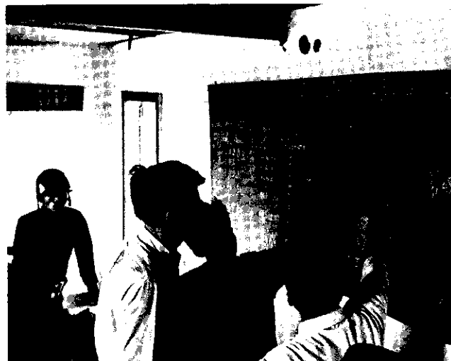
Briefing sessions on hamlet development progress are conducted regularly by Revolutionary Development teams for U.S. Government representatives.

The data are assembled at regular intervals by MACV District Advisors who live in close contact with the villages and hamlets in their region. The computerized measurement of hamlet control is reported under three basic categories—Relatively Secure, Contested, VC Controlled.