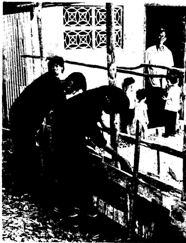
Building projects are underway throughout South Viet-Nam, where Revolutionary Development teams encourage the villagers' participation to give them a direct interest in preserving what they have built.

Although essentially and predominantly a Vietnamese program, the RD effort is supported by United States and other free world assistance missions. Under the overall coordination of the Military Assistance Command in Vietnam (MACV), American aid and technical advice is funneled through U.S. Civil Operations and Revolutionary Development Support (CORDS)—an inter-agency management group which combines the efforts of the Agency for International Development (AID), the U.S. Information Agency (USIA), several U.S. Embassy offices, and the non-combat