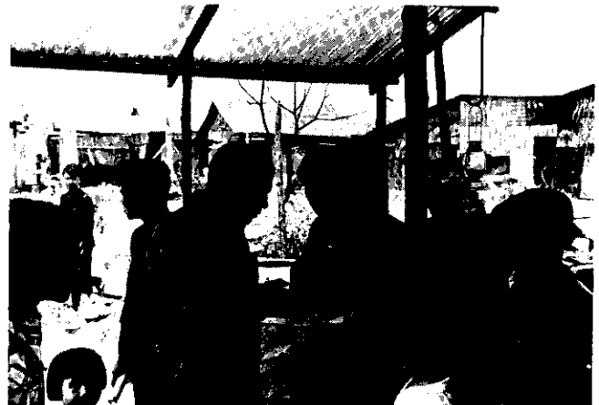
Cadre advisor of the Agency for International Development checks plans for new housing with Revolutionary Development team and local people.

It was at a graduation ceremony of recently elected officials who had completed government training that President Nguyen Van Thieu, speaking extemporaneously, underscored his nation’s resolve to strengthen and support free village elections. “In order to defeat the Communists,” he said, “democracy must be implemented at every level in South Vietnamese life. Democracy is not just having a constitution, an elected assembly, and elected national leaders. For people do not live in the Presidential Palace or in the National Assembly, but in straw huts in the villages and ham-