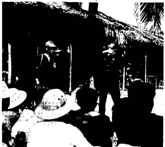
Defense briefing and weapons training is given to local militia by members of Revolutionary Development team.

Creating a secure environment is essentially a matter of people participating in their own defense. The hamlets of Viet-Nam illustrate the point dramatically. Here members of