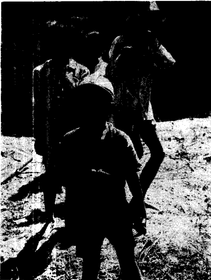
Children cavort for visitors in Son Cong hamlet. Until recently this year, no one but Viet Cong and allied military units ventured into «Street» hamlets for 2 years.

Despite the extension of security and progress in pacification in Thua Thien, there are still several thousand people in refugee status. Nationwide there are hundreds of thousands who are in refugee camps or settled on land other than their own.