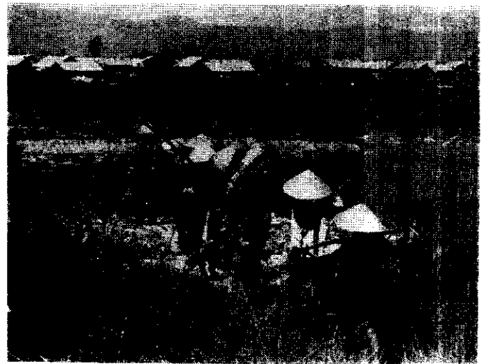
Vietnamese farmers return from morning's work helping dig irrigation canals near their village along the «Street.»

This remarkable transformation was possible due to a number of factors. Prominent among them was the psychological effect of the Communist slaughter of civilians in the area in 1963, including more than 5,000 in Hue alone. Observers in the area agree that the attempt to terrorize the population backfired. Instead of being intimidated, the people reacted with bitter hatred against those who murdered their families and friends.