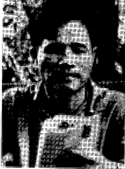
General Nguyen Chi Thanh