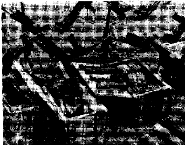
Captured Viet Cong Weapons

The majority of the Viet Cong guerrillas operate in areas familiar to them. Many of the Viet Cong do not have purely military functions, but serve instead as local cadres in areas under Viet Cong control; occasionally they assume paramilitary functions.