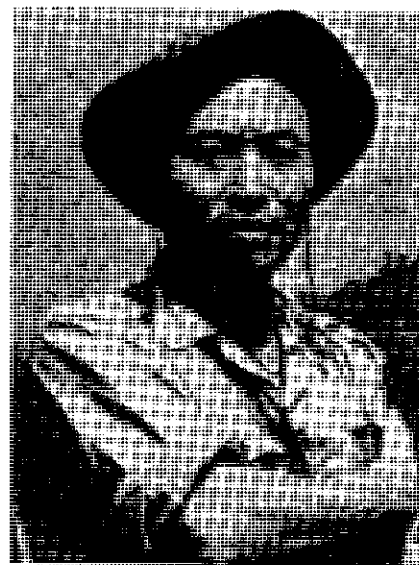
Maj. General Tran Do

forces that can be rallied, win over all forces that can be won over, neutralize all forces that should be neutralized, and draw the broad masses into the general struggle against the U.S.-Diem clique for the liberation of the South and the peaceful reunification of the fatherland."