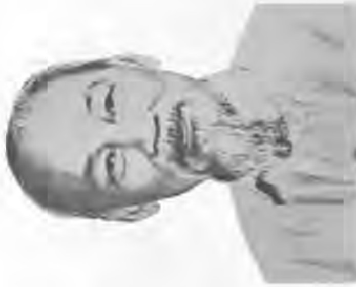
Ho Chi Minh

Save for reducing the Viet Minh threat, most of this program was completed by 1958.