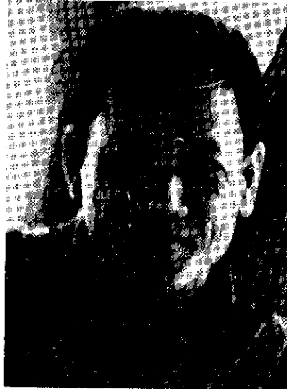
Lt. General Tran Van Tra