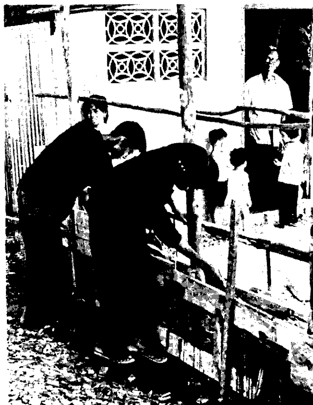
Building projects are underway throughout South Viet-Nam, where Revolutionary Development teams encourage the villagers' participation to give them a direct interest in preserving what they have built.

Although essentially and predominantly a Vietnamese program, the RD effort is supported by United States and other free world assistance missions. Under the overall coordination of the Military Assistance Command in Vietnam (MACV), American aid and technical advice is funneled through U.S. Civil Operations and Revolutionary Development Support (CORDS)—an inter-agency management group which combines the efforts of the Agency for International Development (AID), the U.S. Information Agency (USIA), several U.S. Embassy offices, and the non-combat