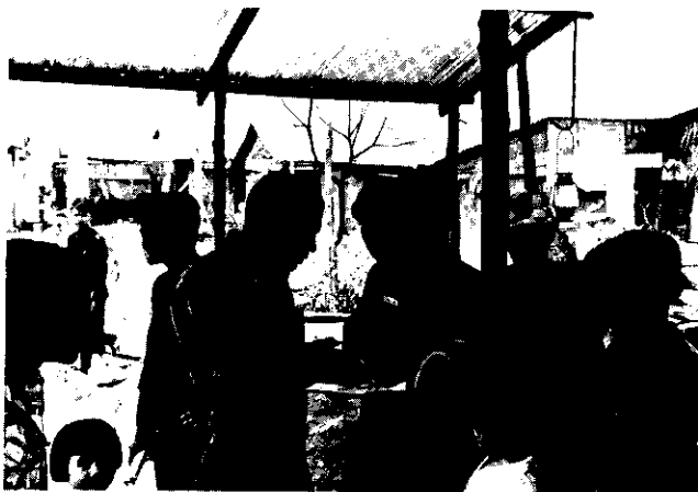
Cadre advisor of the Agency for International Development checks plans for new housing with Revolutionary Development team and local people.

It was at a graduation ceremony of recently elected officials who had completed government training that President Nguyen Van Thieu, speaking extemporaneously, underscored his nation’s resolve to strengthen and support free village elections. “In order to defeat the Communists,” he said, “democracy must be implemented at every level in South Vietnamese life. Democracy is not just having a constitution, an elected assembly, and elected national leaders. For people do not live in the Presidential Palace or in the National Assembly, but in straw huts in the villages and ham-