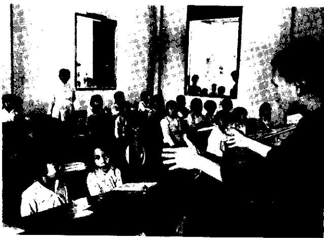
Revolutionary Development team members not only help to build schools, they also assist in the educational process.

ganizes citizen groups, and improves local government. The remaining section assists village officials in the implementation of development programs.