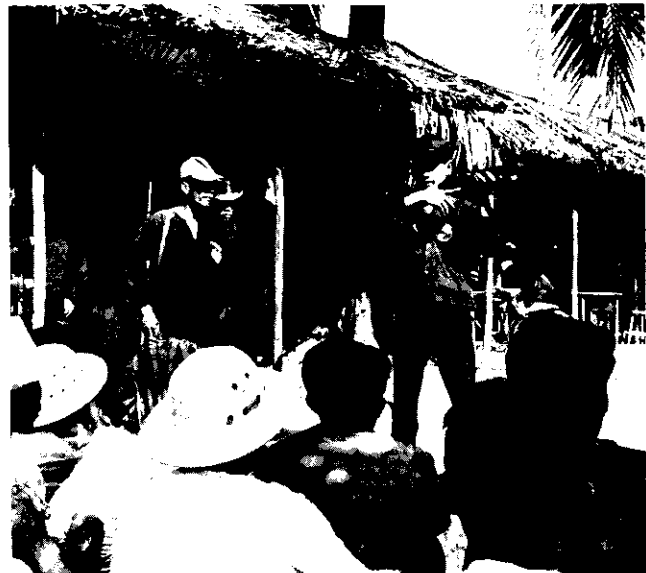
Defense briefing and weapons training is given to local militia by members of Revolutionary Development team.

Creating a secure environment is essentially a matter of people participating in their own defense. The hamlets of Viet-Nam illustrate the point dramatically. Here members of