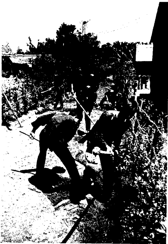
Revolutionary Development team workers assigned to this secure hamlet help dig drainage ditches along the roads after installing barbed wire around the houses.

The rural policeman on his remote hamlet beat, or the ARVN medic bandaging a villager's