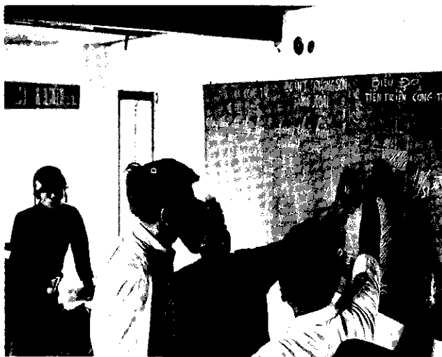
Briefing sessions on hamlet development progress are conducted regularly by Revolutionary Development teams for U.S. Government representatives.

The data are assembled at regular intervals by MACV District Advisors who live in close contact with the villages and hamlets in their region. The computerized measurement of hamlet control is reported under three basic categories—Relatively Secure, Contested, VC Controlled.