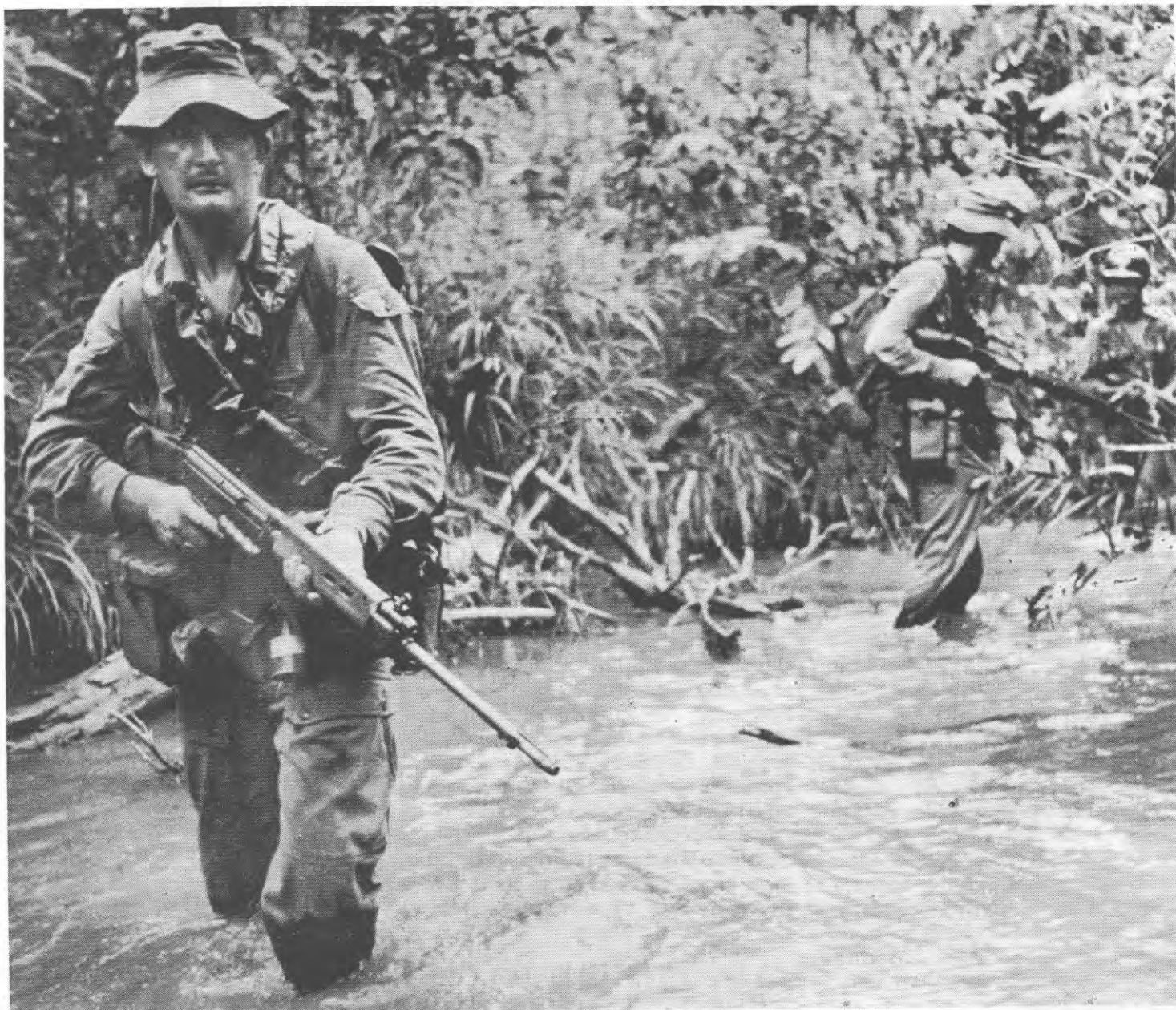
As Operation «Quyet Thang» (We Strive for Victory) jumps off in Phuoc Tuy province, Australian troops attached to a South Vietnamese battalion ford a stream with guns ready. There are 8,000 Aussie troops in South Vietnam.

in the morning after the Communists were routed, Australian casualties were 18 dead and 22 wounded. The action produced the largest number of enemy casualties in a single engagement up to that time — 245 dead — and earned Delta Company the U.S. Presidential Unit Citation.