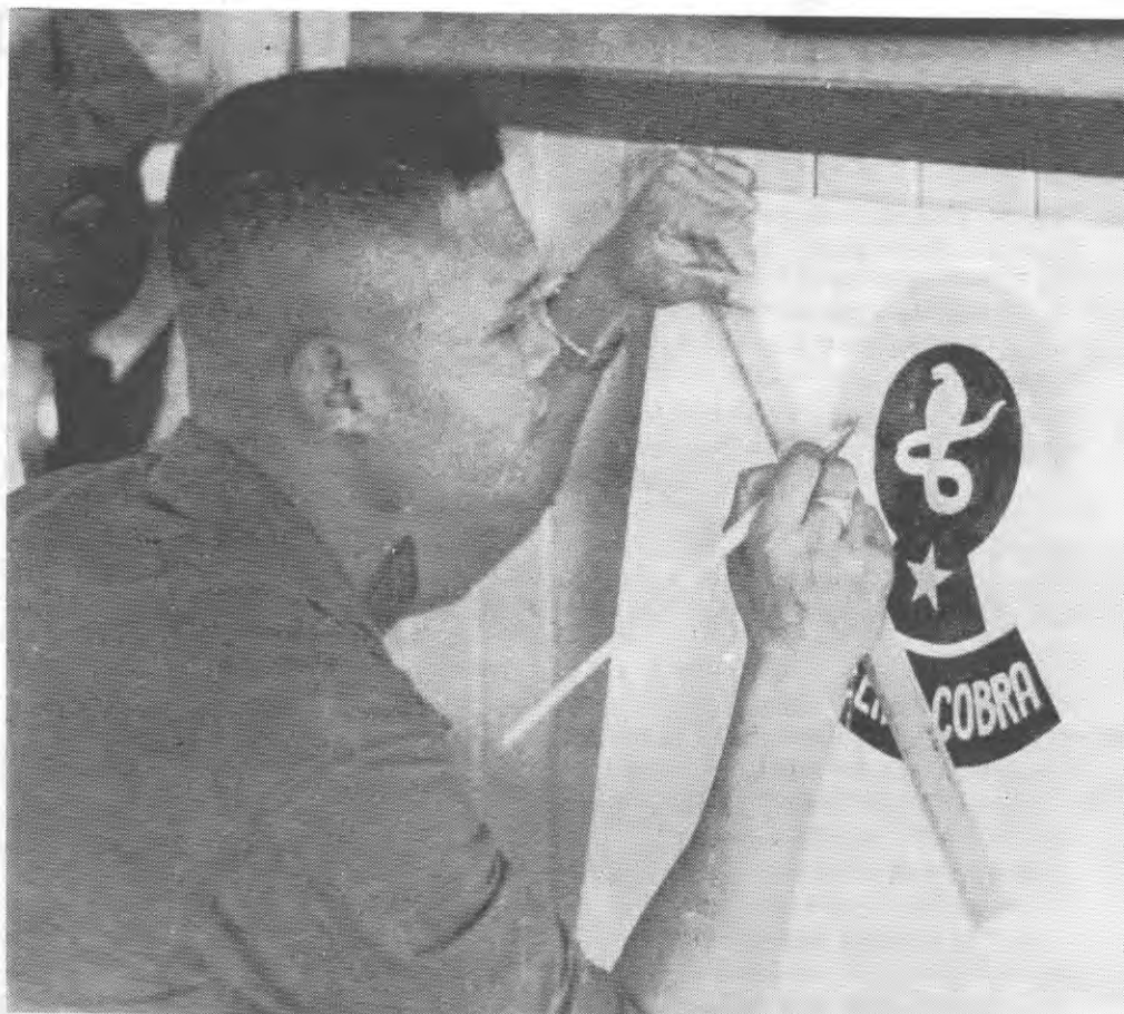
Soldier paints emblem of Queen's Cobras, first Thai troops in Vietnam.