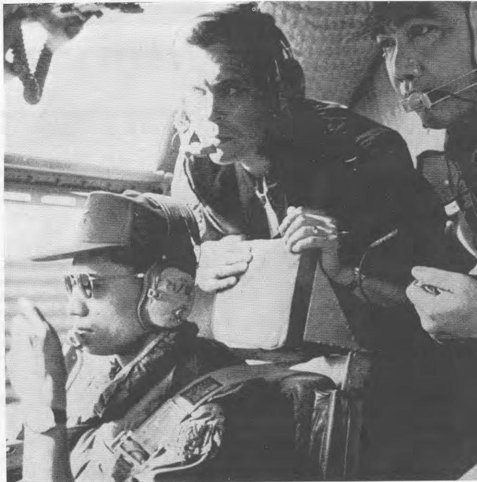
Royal Thai Air Force officers with USAF major (center) in supply mission.

The Dove unit has trained 540 Vietnamese as mechanics, dressmakers and typists. Its doctors and corpsmen have given medical treatment to 639,000 patients at dispensaries and clinics. But the biggest medical project undertaken by the ROKs is the hospital in Vung