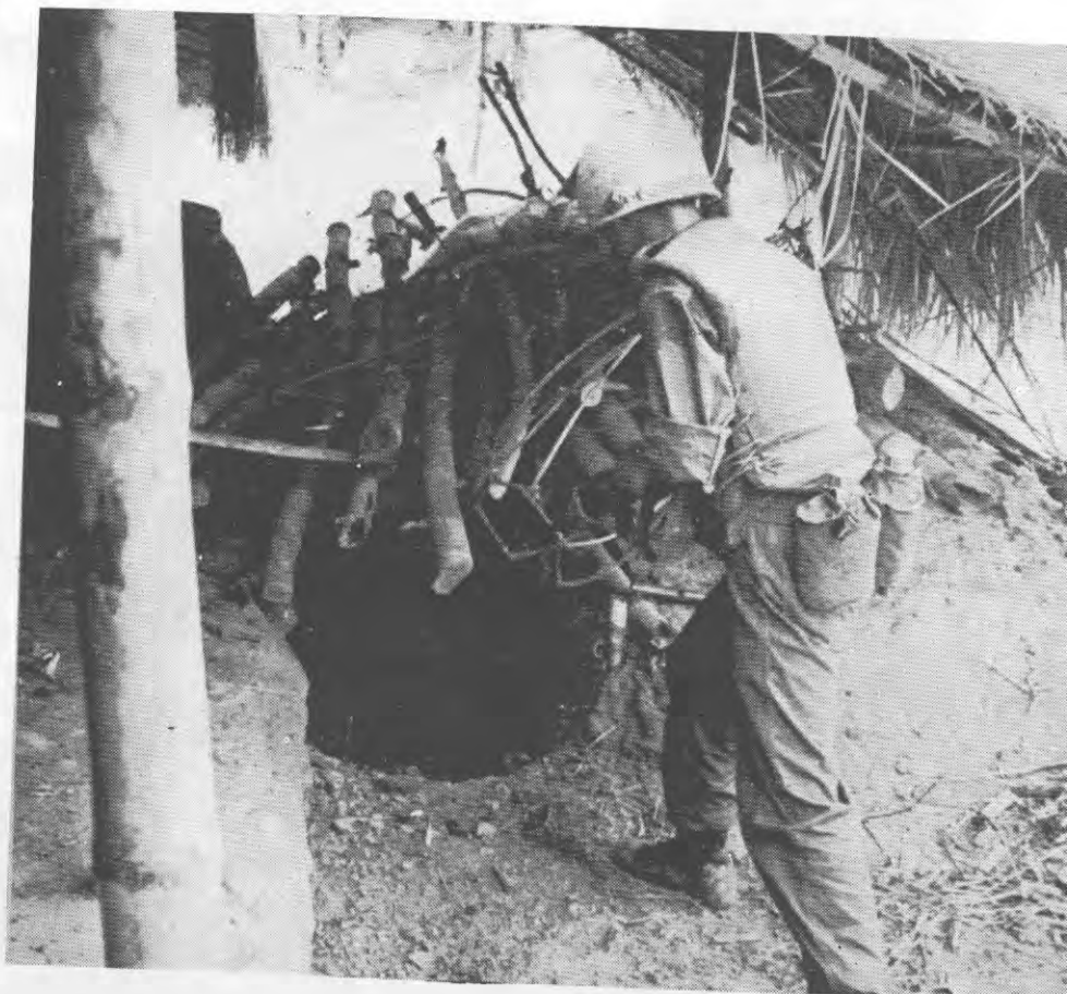
Korean trooper prepares to enter VC underground bunker in Tuy Hoa area.