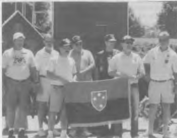
ADVA members gather at the North Wall in Windsor, Ont., July 6, 2002

I have attended the memorial service at the North Wall in Windsor, Ontario, a few times in the last five years. I thought this event would be a great catalyst for a mini reunion here in Michigan.