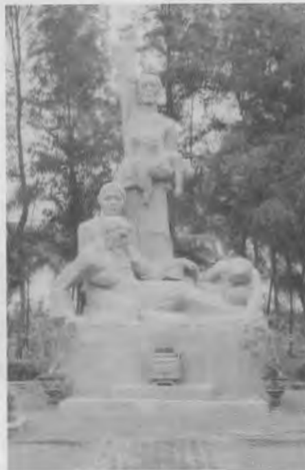
Monument at My Lai

Samples: "I couldn't find the area where I landed that day ... it was a God-awful amount of fire. We lost some good men. But My Lai was the area we supported so I went to see it. I didn't know what to expect."