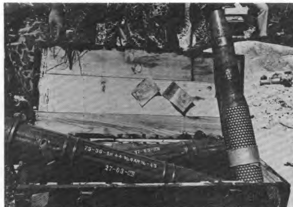
SOUTH VIET-NAM. Chinese language markings plainly visible on these 77mm. recoilless rifle shells found in offshore caves in South Viet-Nam show that they were manufactured in Communist China. At least 100 tons of North Vietnamese military supplies, mostly from Communist China and Czechoslovakia, were found in this spot alone.

"Today in South Viet-Nam we are witness to ... a war that is waged by men who believe that subversion and