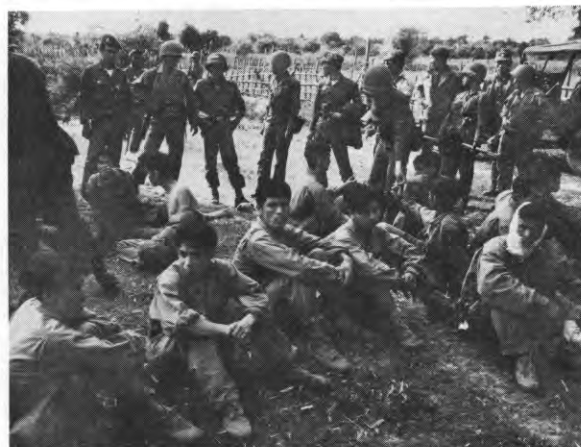
LAOS. Lao soldiers guard North Vietnamese Regular Army soldiers after their capture in Thakhek, Khammouane Province. The Vietnamese soldiers were guarding a cave containing Communist Chinese-manufactured weapons and supplies.

Soviet foreign policy has been complicated by the ideological divisions which