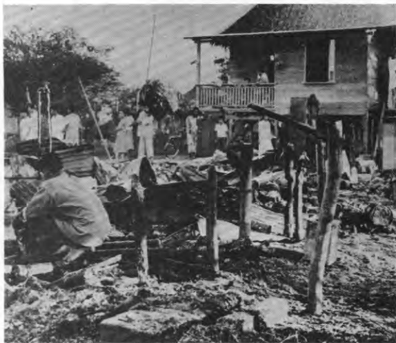
PHILIPPINES. Townspeople search the wreckage of their homes after a Communist-led Hukbalahap guerrilla raid on Luzon Island August 25, 1950. Guards ringed Manila after a weekend of terror by the Huks left a death toll of 85 persons in nearby communities.

excuse for a war of national liberation by giving the country its independence under a democratically elected government.