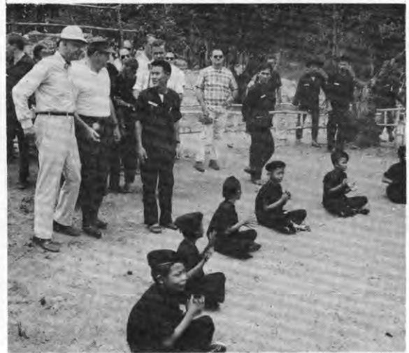
VIET-NAM REVOLUTIONARY DEVELOPMENT. Vice President Humphrey and Ambassador Ellsworth Bunker observe young Vietnamese boys being taught national songs at the Vung Tau National Revolutionary Development Center. The Center has graduated more than 30,000 young rural men and women who have gone into hamlets threatened or controlled by the Viet Cong to assist the local people in resisting Communist intimidation. The Vice President flew from Saigon where he was attending the October 1967 inauguration of President Thieu.

4. Efforts to initiate a peaceful settlement. From the outset of the war in Viet-Nam, the United States has tried to move from the battlefield to the conference table. President Johnson often has offered talks without preconditions. Hanoi's response until May 3 was to demand preconditions of its own. The U.S. response, in effect, has been: If Hanoi demands such a precondition as a halt to the bombing, the United States has a right to ask for assurance that Hanoi will not take military advantage of such a halt. Moreover,