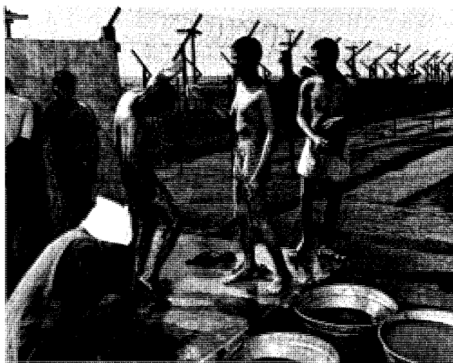
Prisoners showering and washing clothes at South Vietnamese PW camp at Pleiku.

The Geneva convention imposes an absolute obligation to release prisoners of war. Prisoners who are seriously sick or wounded and who wish to return home must be sent back to their own country as soon as they are fit to travel. Other sick and wounded prisoners whose health would be benefited thereby should be accommodated in neutral countries. The parties to the conflict are required, throughout the duration of hostilities, to endeavor to make arrangements for such accommodation. The parties to the conflict "may, in addition, conclude agreements with a view to the direct