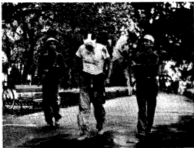
A captured American pilot is led by North Vietnamese guards through the streets on his way to a "press conference" in Hanoi. [Photo and caption information from an official Communist source.]

The case of Navy pilot Commander Jeremiah A. Denton, Jr. appears to confirm that U.S. prisoners are being abused in this manner. In May 1966 Commander Denton in an interview on a Japanese television network said, "I don't know what is happening in Viet-Nam but whatever my government's policy is I support it." The pilot said he felt pretty well. "I get adequate food, clothing, and medical care when I require it." However, a close-up shot of the American prisoner showed his face drawn and haggard, and his eyes appeared heavy-lidded. He spoke haltingly and rolled his eyes continually, at times staring blankly at the ceiling. He would occasionally close his eyes tightly when asked to answer a question.