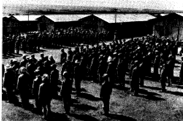
North Vietnamese and Viet Cong prisoners of war assembled before their barracks at PW camp at Pleiku, South Viet-Nam.

Under the Geneva convention, the main categories of prisoners of war include the regular armed forces of the parties to the conflict; certain civilians accompanying the forces; and guerrilla forces if they are subject to a commander, carry arms openly, wear a uniform or other distinctive sign recognizable at a distance, and comply with the laws and customs of war. By these standards, a great many Viet Cong would not qualify for prisoner-of-war status because they do not wear any uniform, do not carry arms openly, and commonly violate the rules of warfare. These rules would disqualify many guerrillas as well as terrorists. However, South Viet-Nam and the United States have adopted broad definitions for quali-