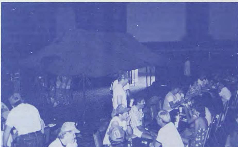
Lunch . . . Army style.

"Duce and a half" truck and an M-151 Jeep pulling a trailer holding soft drinks and kegs of beer on ice. At the end of the serving line was a lister bag supported by the familiar three tent poles. Lunch was served on tin plates with plastic spoons. Background music was from an AFRVN