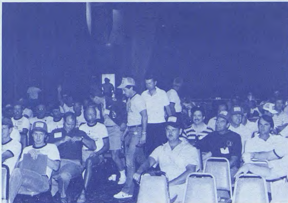
Annual Business Meeting — ugh! What a crew!!