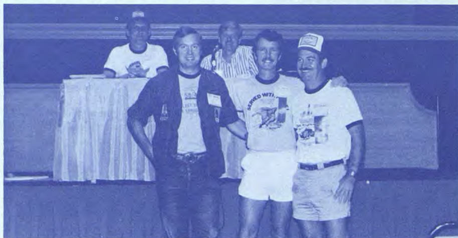
YOUR EXECUTIVE COUNCIL MINUS 1: