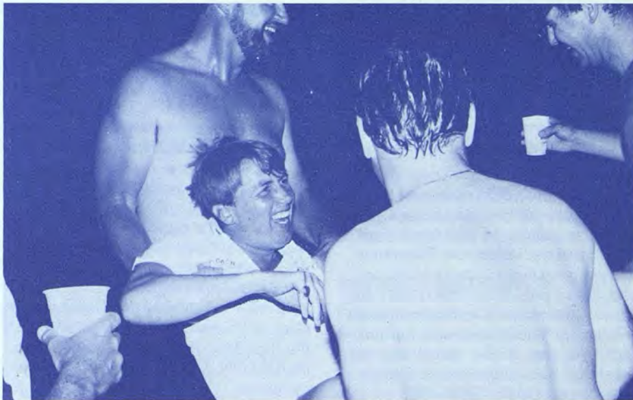
Drink!! A drink you say!!

January 26-28, 1986, for all you that had to work and could not make the last two summer reunions.