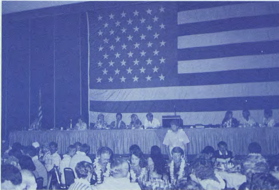
The '85 Reunion Banquet