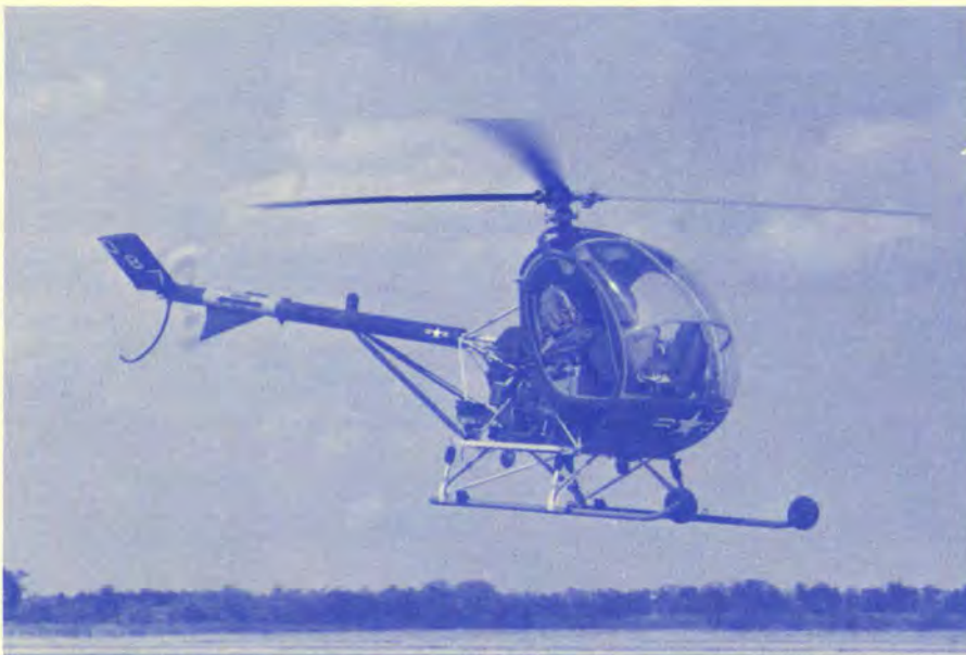
Ft. Wolthers, Texas - 1967