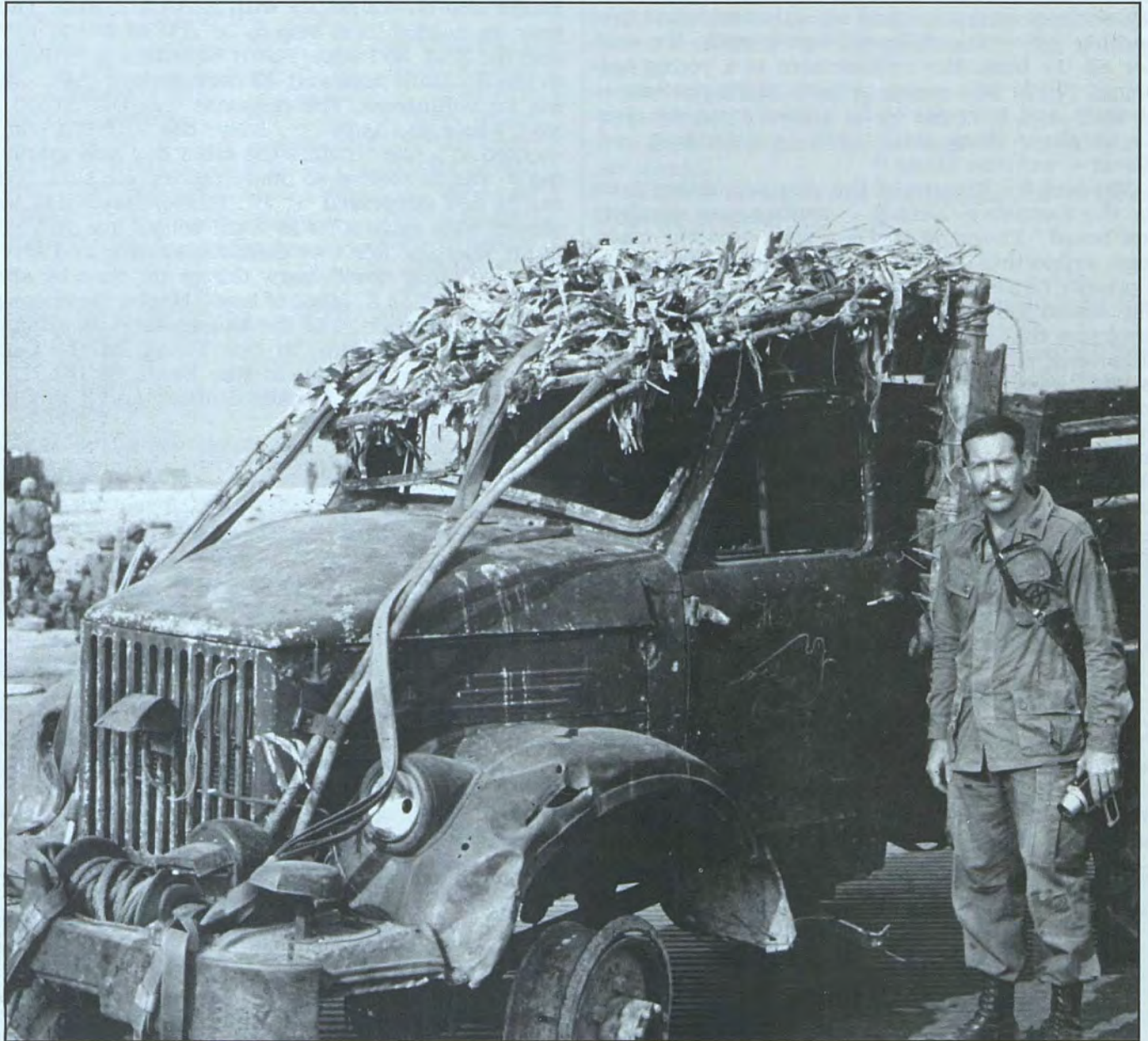
Gay DeWitt stands beside an NVA truck lifted by Chinook to show it had been captured. Letter, Page 6