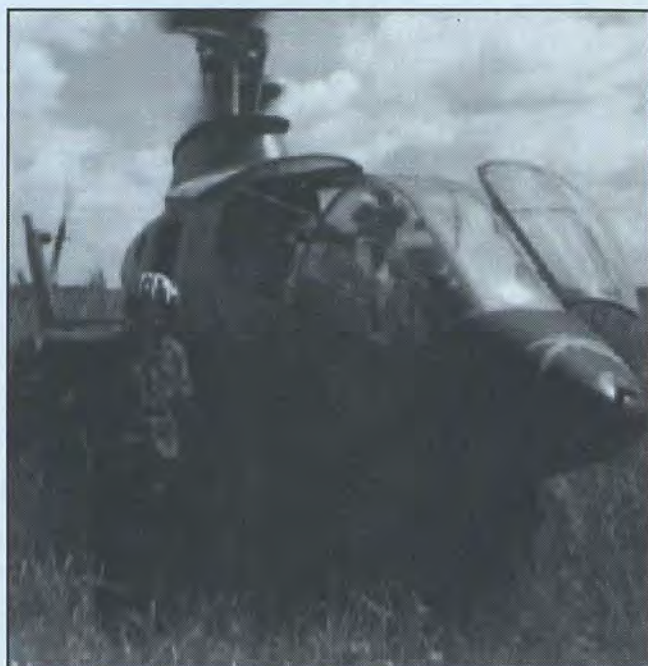
Iron Triangle, III Corps.

The Vietnam Helicopter Pilots Association has teamed up with Turner Publishing company, the leading publisher of military association histories, to create the definitive history of helicopter aviation during Vietnam. No one can tell the true story of what happened in Vietnam like the actual men who served there. This history book will not be complete without your help. Send your biography and special experience stories today!