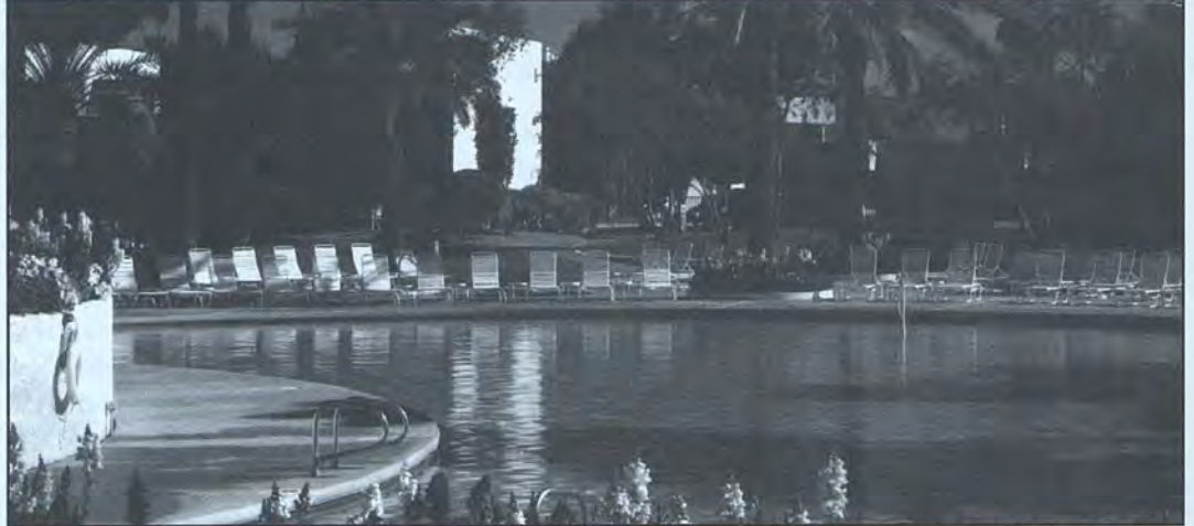
The Registry resort sports Arizona's most extravagant swimming pool, plus three additional pools. The Plaza resort has five pools. The two resorts will host the VHPA's 1993 Reunion in the Phoenix/Scottsdale area.

winners will be made June 1, and the selection will be made from all who have made reservations through May 31.