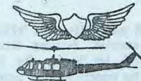
WINGS / H-MODEL