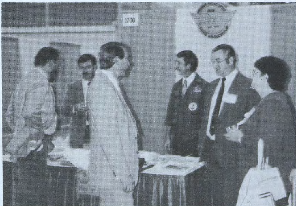
The VHAP Booth at the Helicopter Association International's annual convention in New Orleans, January 17-19.

Through the efforts of many, the VHAP acquired booth space at the Helicopter Association International's annual convention, held in New Orleans, January 17-19. The show was a great success, with over 5,000 people attending on the first day alone. VHAP members were easy to spot. Bright day-glow orange stickers had been placed on their name badges, which were printed in black with VHAP and a small Huey.