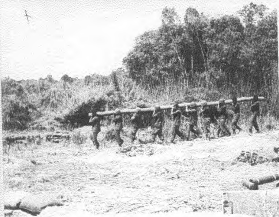
HAULING LOGS FOR FORTIFICATIONS