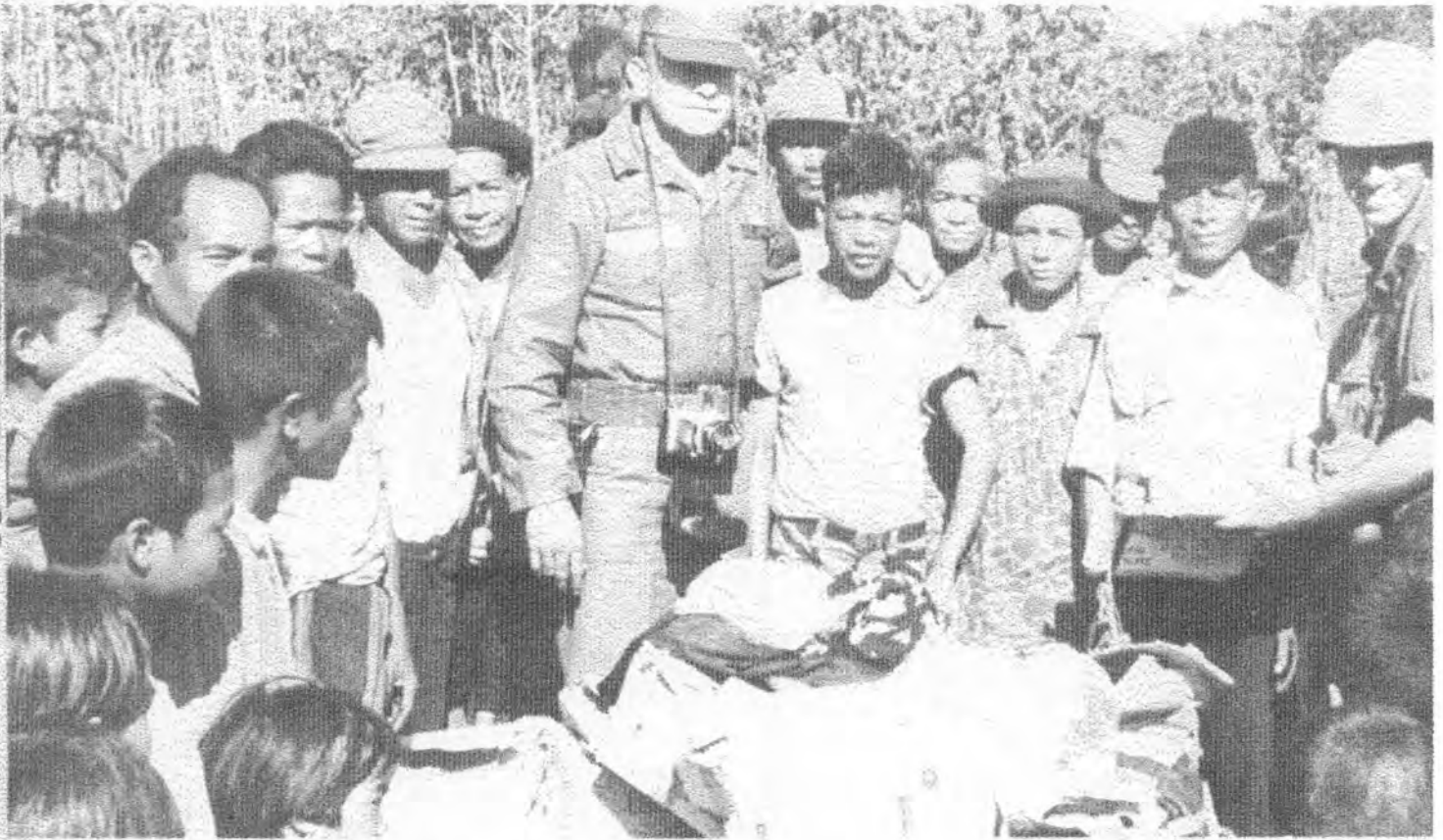
GOOD WILL PACKAGES FROM THE PEOPLE OF NEVADA