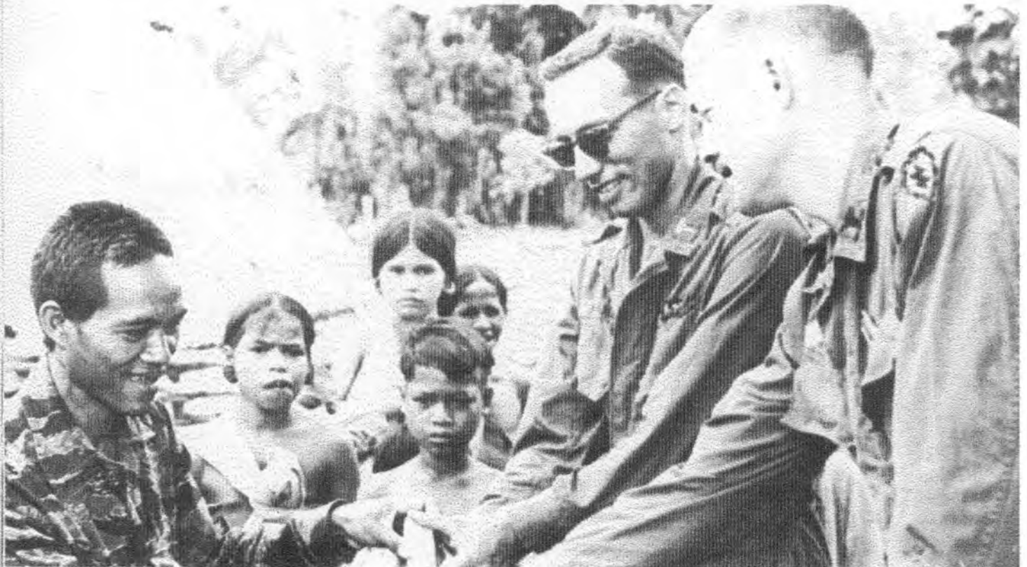
MONTAGNARD CHIEF EXPRESSES THANKS FOR MEDICAL TREATMENT RECEIVED BY HIS VILLAGE.