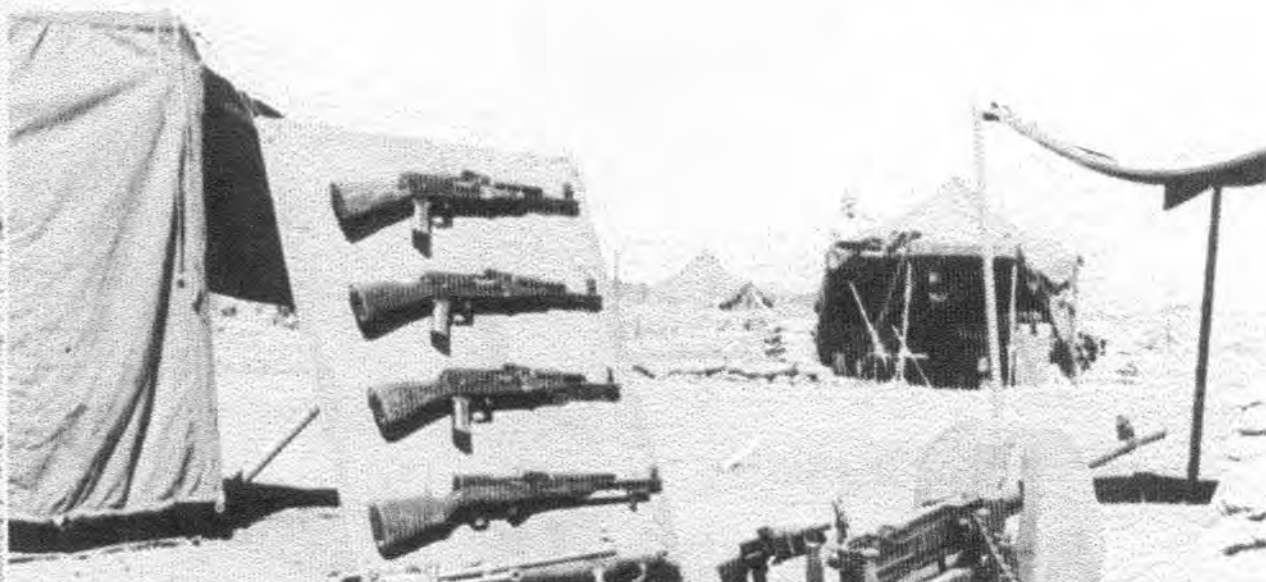
DISPLAY OF CAPTURED ENEMY WEAPONS