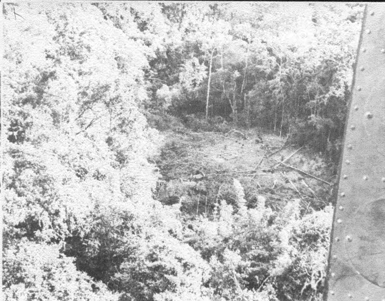
AERIAL VIEW OF LZ BEING CLEARED