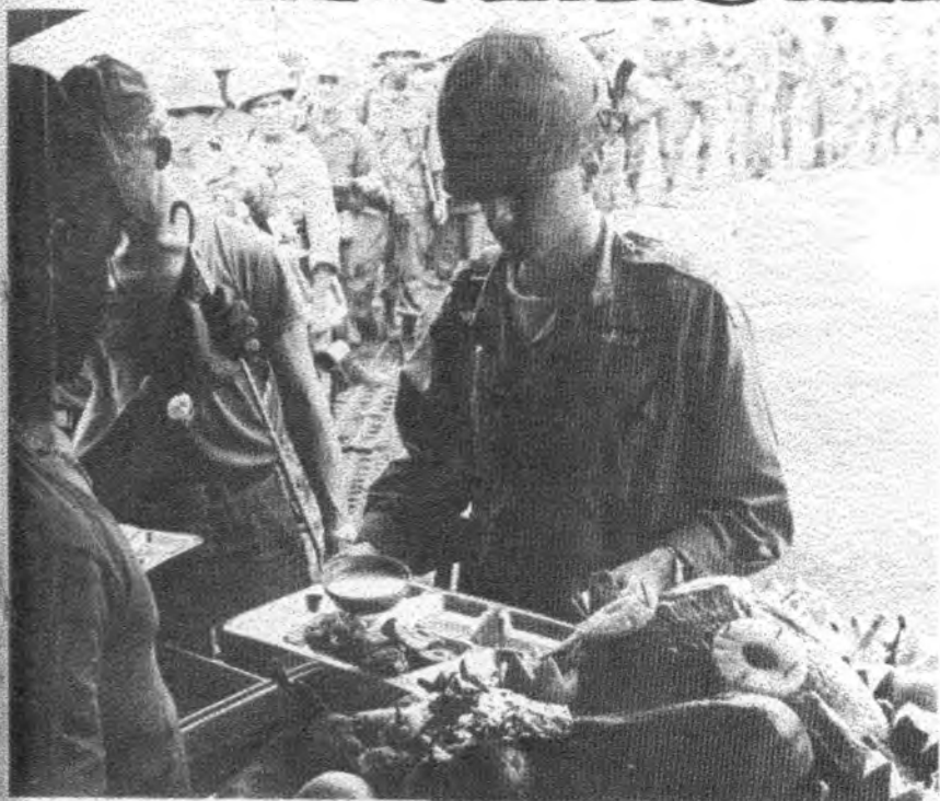
TURKEY DINNER AT FORWARD COMMAND POST