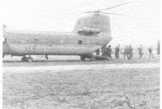
RETURNING TO BASE CAMP FOR