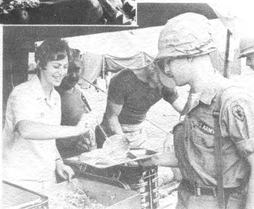
RED CROSS CAME UP TO ADD TO THE OCCASION