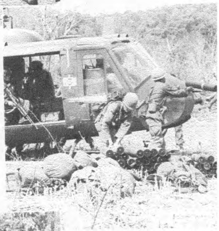
LOADING MORTAR AMMO