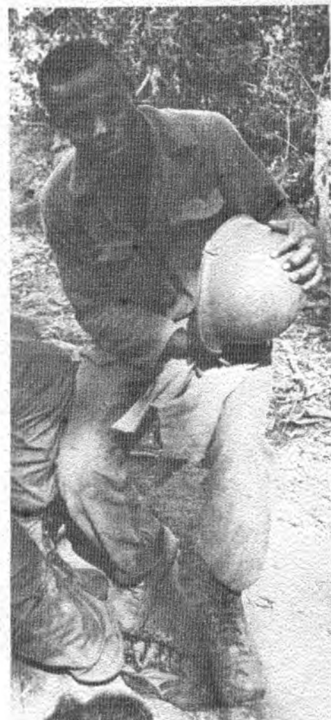
THIS ONE JUST CREASED