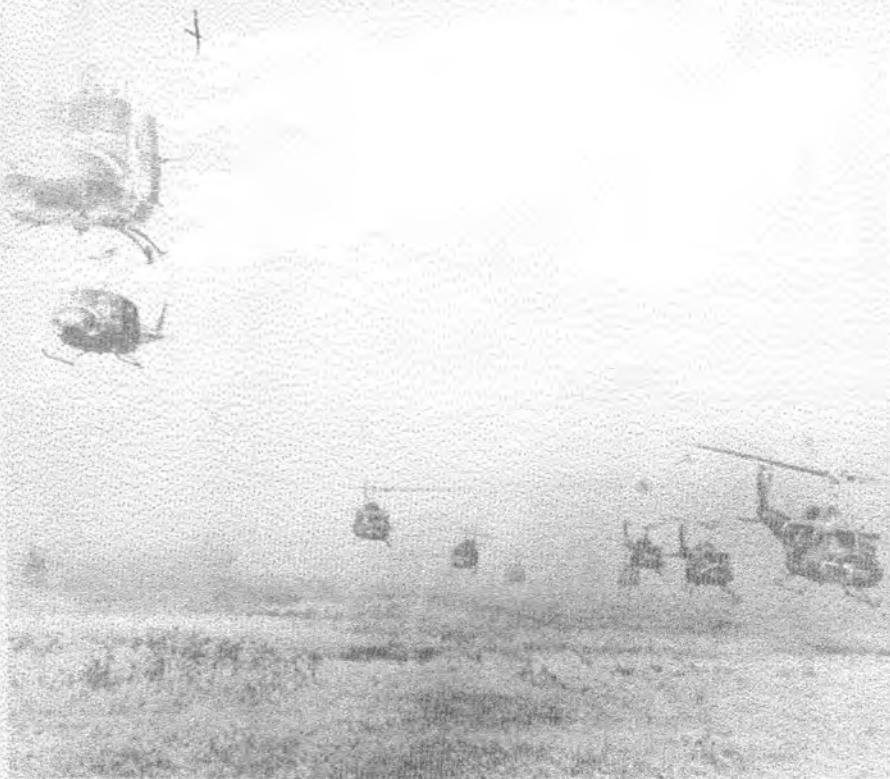
"HUEYS" LIFT OFF AFTER DROPPING TROOPS OF 1/14 "GOLDEN DRAGONS" NEAR CAMBODIAN BORDER