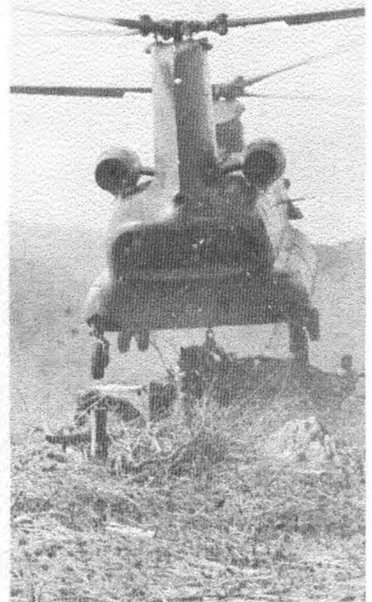
"CHINOOK" READIES TO LIFT 3/4 TON TRUCK