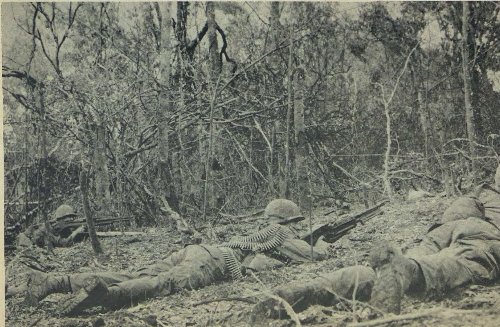
Smashed Limbs And Torn, Bullet Scarred Tree Trunks Bear Mute Testimony To The Fighting In Which The 1st Squadron, 10th Cavalry Inflicted So Many Casualties On The Enemy.