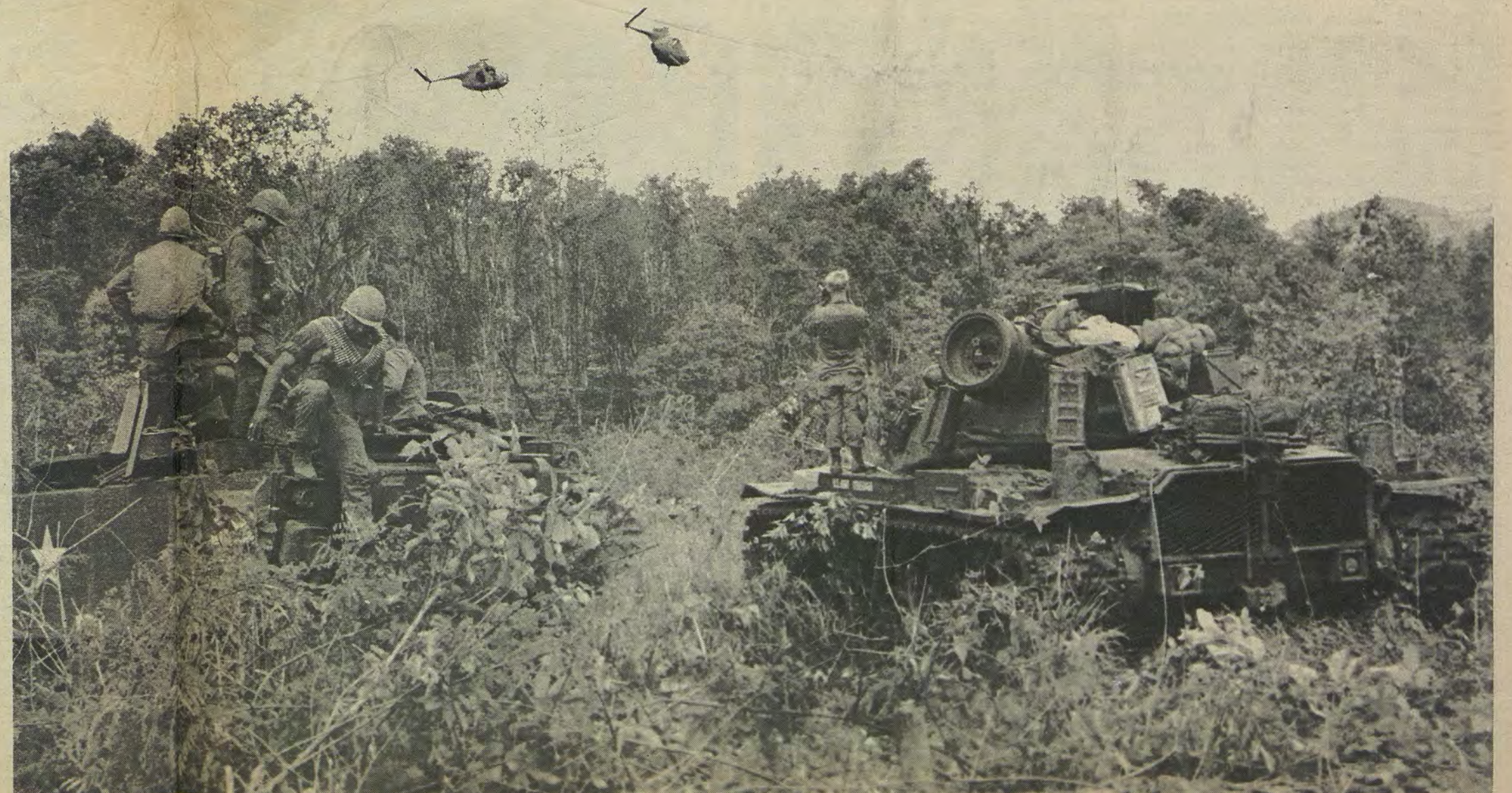
Light Observation Helicopters, Tanks And Armored Personnel Carriers (APC) From The Cav Unit Scan The Woodline Before Rolling Into The Thick Jungle Thicket To Ferret Charlie From His Stronghold. A Total Of 95 Enemy Soldiers Died In The Fighting Near Pleiku.