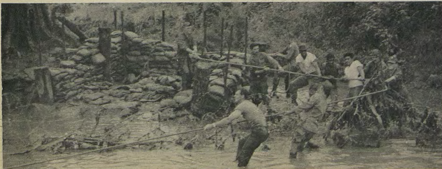
Engineers Strain To Tighten A Cable Over The Dak Psi River As The First Step Toward Building A Bridge.