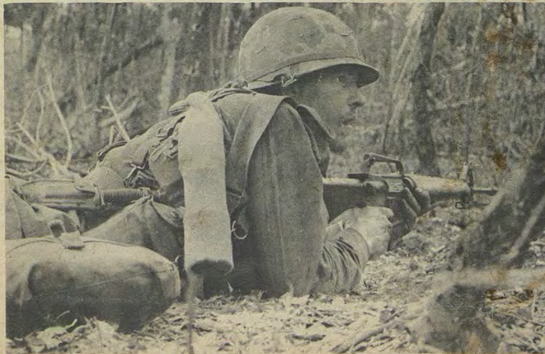
WAITING GAME — A Fourth Division soldier hits the ground as enemy AK47 and B40 rounds scream overhead. The 1st Squadron, 10th Cavalry soldiers cleared the NVA from an area 10 miles northwest of Pleiku.

By the time the cavalrymen were finished, the list of captured ammunition included 7,000 rounds of AK47 ammo, 72 B41 rockets, 22 B40 rockets, 50 pounds of plastic explosives and 81 B41 propellant charges.