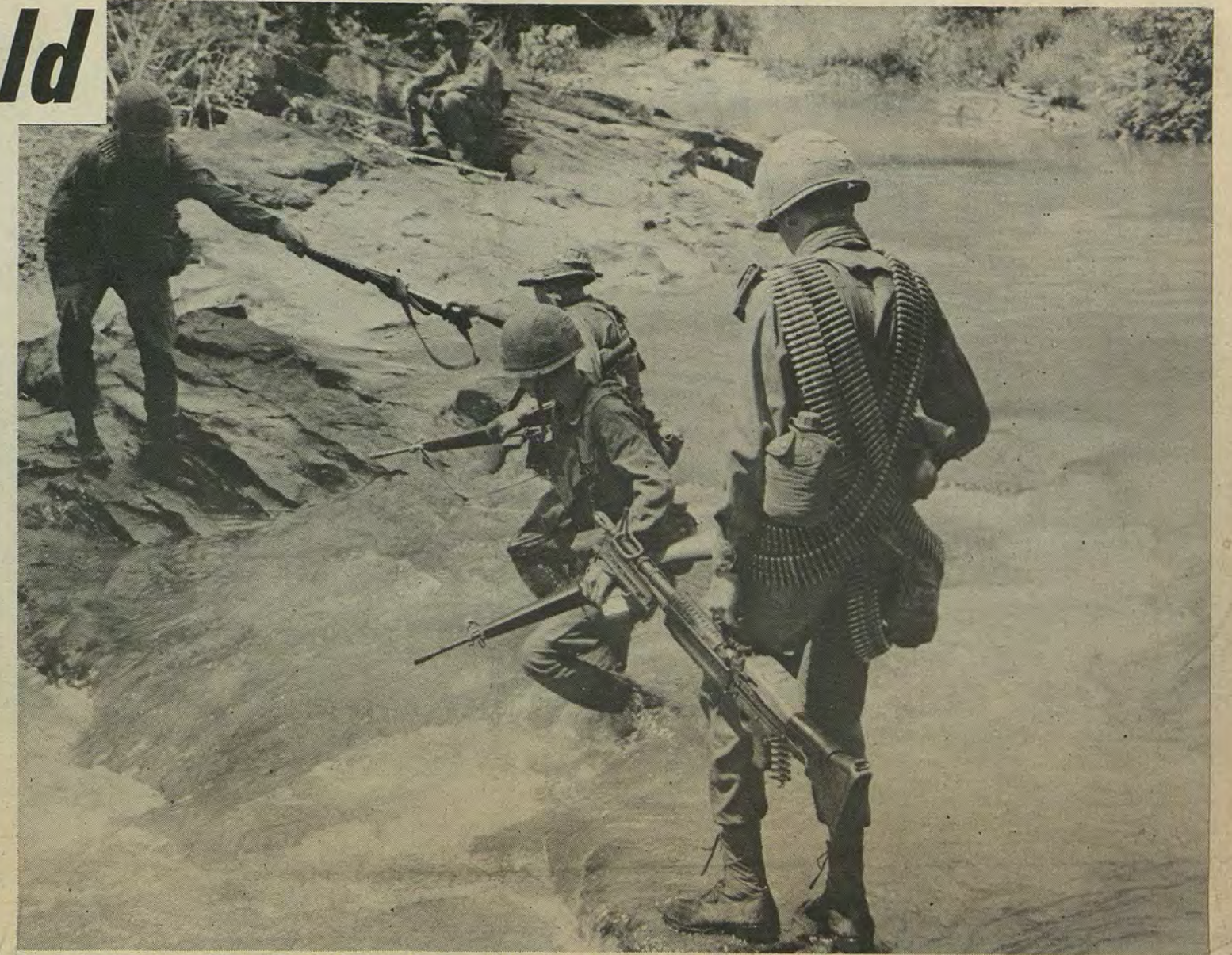
Buffalo Soldiers Help Each Other Cross A Stream During A Sweep Of Suspected NVA Staging Areas Around Pleiku. Teamwork Payed Off For The Bisons In The Very Successful Operation.