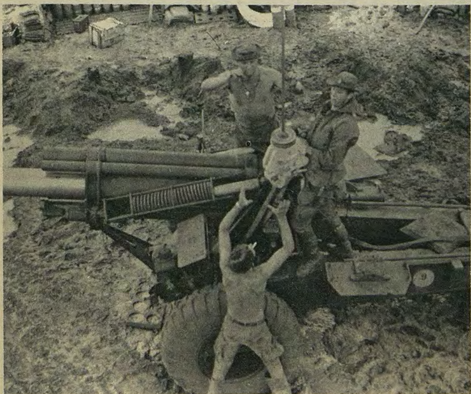
Monsoon Rains Bring Mud, But That Doesn't Slow The Redlegs