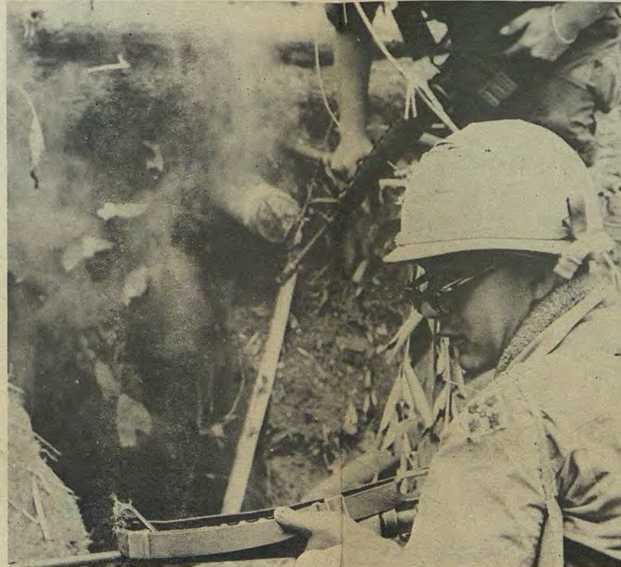
Cavmen Blow One Of The Many Bunkers Found During Search Missions. This One Had Three Feet Of Overhead Cover.