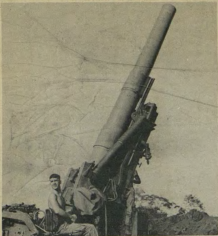
An Eight Inch Gun Awaits Infantry's Call