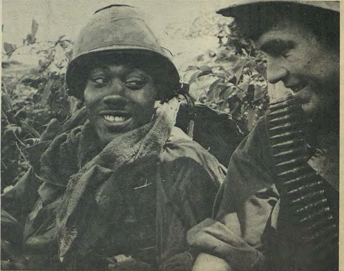
RELAXED AT LAST —Two tired but happy Famous Fighting Fourth Division soldiers relax after action in the Central Highlands. Division troops have been sweeping the Highlands and hitting the enemy in his staging areas before he can do any damage.

"Our recon element noticed that the eight enemy suspects were walking into an open area," continued Captain Scott, "and they readied themselves before small arms fire was exchanged."