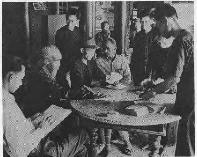
COUNTING THE BALLOTS. Government officials, the outgoing chairman of the hamlet council, and the Revolutionary Development Team leader, count the ballots in the presence of the assembled RD team and a few curious spectators on election day July 12, 1966.

In keeping with that pledge, the Government issued a series of decrees in December 1966 completely revising the structure and functioning of local government. These decrees provide for popularly elected village councils, which will choose the village chief from among their membership, and for popularly elected hamlet chiefs, with elected deputy chiefs in hamlets having more than 3,000 residents. Moreover, village and hamlet officials will enjoy generally unrestricted exercise of a wide range of new powers. For example, only village budgets or programs in excess of one million piasters (about $8,500) need have prior approval by the central government.