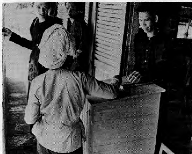
CASTING THE BALLOT. Vietnamese woman drops her ballot in the box as Revolutionary Development Team members look on. A Viet Cong concentration across the river from the polls was under attack by government forces during the voting. But the residents were accustomed to this martial background to their daily lives.

more villages and hamlets will qualify for and hold elections. New, representative leadership at the local level will emerge from these elections of approximately 13,000 local officials this spring and approximately 3,300 more during the summer.