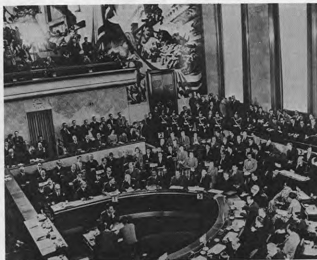
GENEVA CONFERENCE 1954. A general view of the opening of the Geneva Conference of 1954 shows among the assembled delegates (1) Foreign Minister Georges Bidault of France, (2) Secretary of State John Foster Dulles of the United States, (3) Foreign Secretary Anthony Eden of the United Kingdom, (4) Foreign Minister Chou En Lai of Communist China, and (5) General Nam Il of North Korea.

During 1967 a new round of village and hamlet elections is being held involving the selection of over 900 village councils and nearly 5,000 hamlet chiefs. Viet Cong acts of mining, mortaring, assassination, and attempts to destroy the registration cards of the qualified voters have failed to keep the South Vietnamese from the ballot boxes. Despite precarious security conditions in many parts of the country, they remain as resolute in exercising the right of self-determination today as did many of them in 1954, when the Geneva agreements gave them the choice of "voting with their feet" between North and South and nearly one million chose to leave the North for South Viet-Nam.