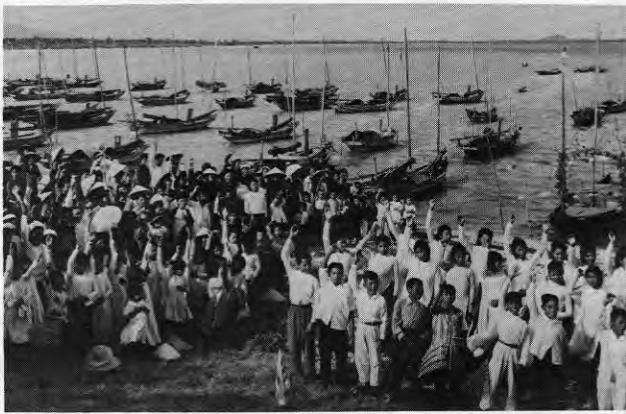
REFUGEES FROM NORTH VIET-NAM. These people were among the more than 1,000 refugee fishermen led by their parish priest from Communist North Viet-Nam in the fall of 1954 into free South Viet-Nam.