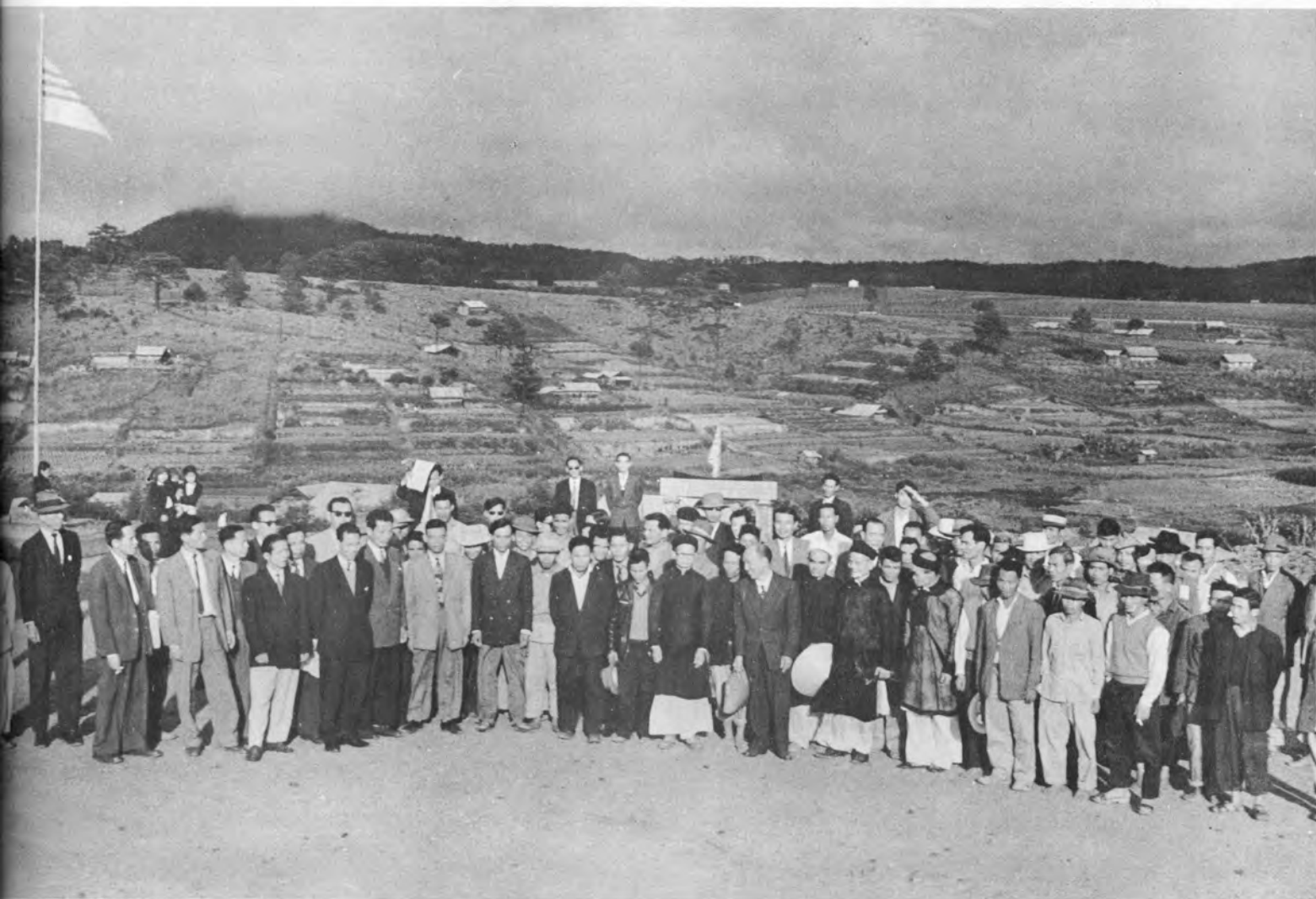
Village meeting of members of the Dalat Vegetable Cooperative for the purpose of setting up local units (small groups) in preparation for member education. This cooperative has over 3000 members living in some 42 hamlets and villages. Its difficulties have been traced largely to the members lack of understanding of the cooperative and failure of members to exercise proper care in the selection and follow-up of the Board of Directors and management. This intensive educational effort is designed to help overcome these limitations.