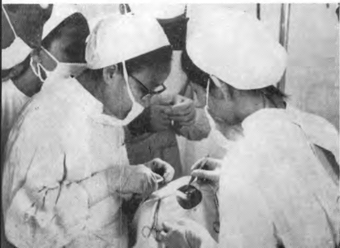
An ophthalmic operation in progress