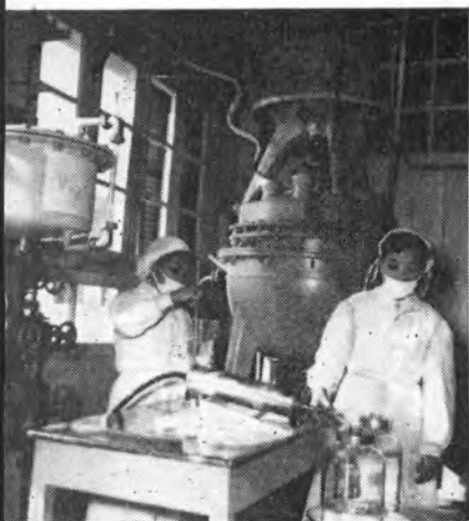
In a pharmaceutical factory.