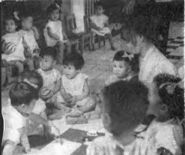
A nursery of a factory.