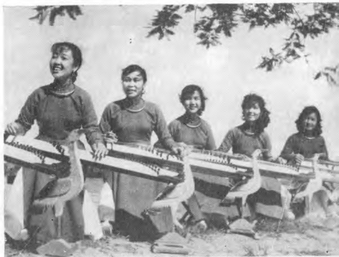
These artists have brought their songs to the fighters at the fronts.