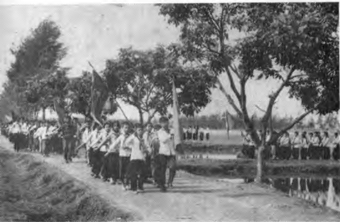
The pupils of a school in Ha Bac province going camping.