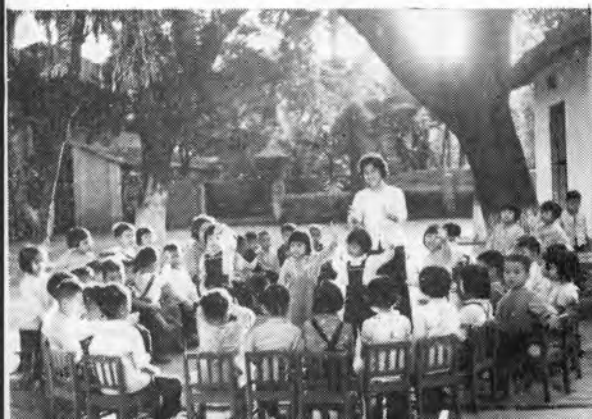
The "Fledgling" infant- school.