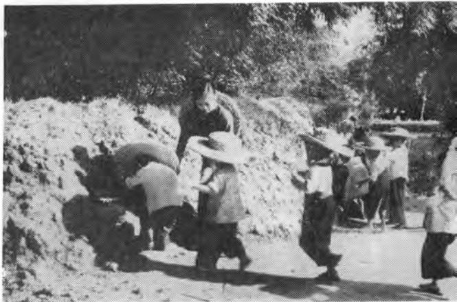
Sham air-raid alert at an evacuated infant - school.