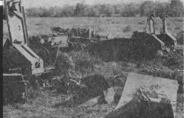
U.S. armoured vehicles destroyed by the L.A.F. during operation "Cedar Falls" at Cu Chi.

Many GIs of the 1st Infantry Division have died a shameful death at Bong Son following a raiding operation.