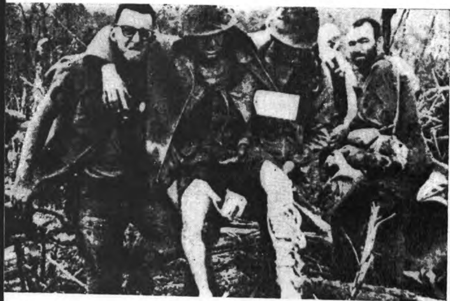
A snapshot which tells much about the G.I.'s fate