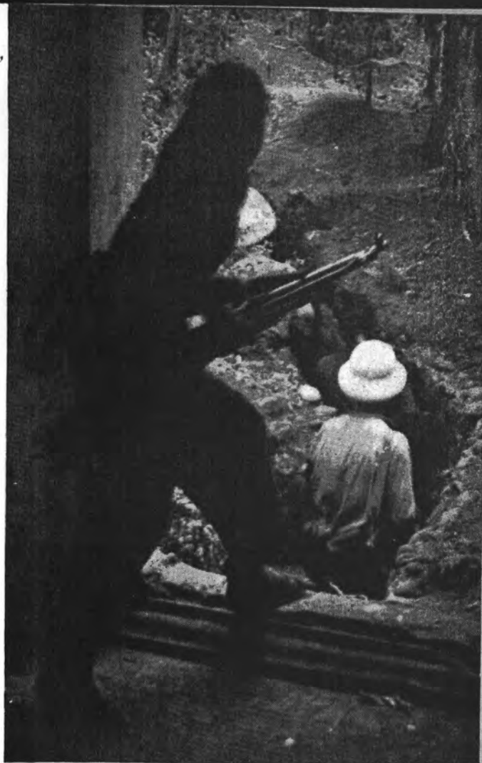
A combat village