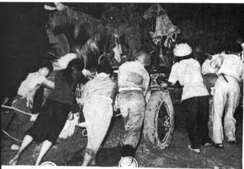
Hauling of A.A. batteries