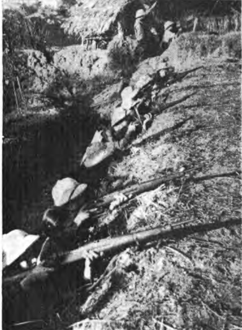
Simple weapons coupled with sophisticated weapons