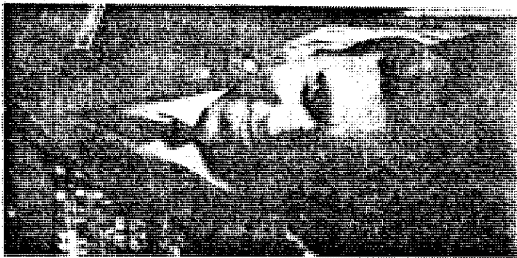
NAVIGATOR - 68