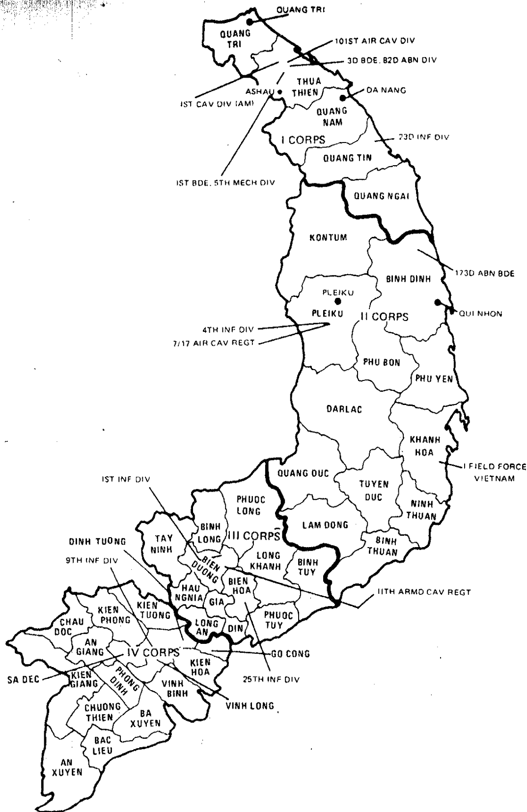
Figure 2. Disposition of Major US Army Units in South Vietnam.