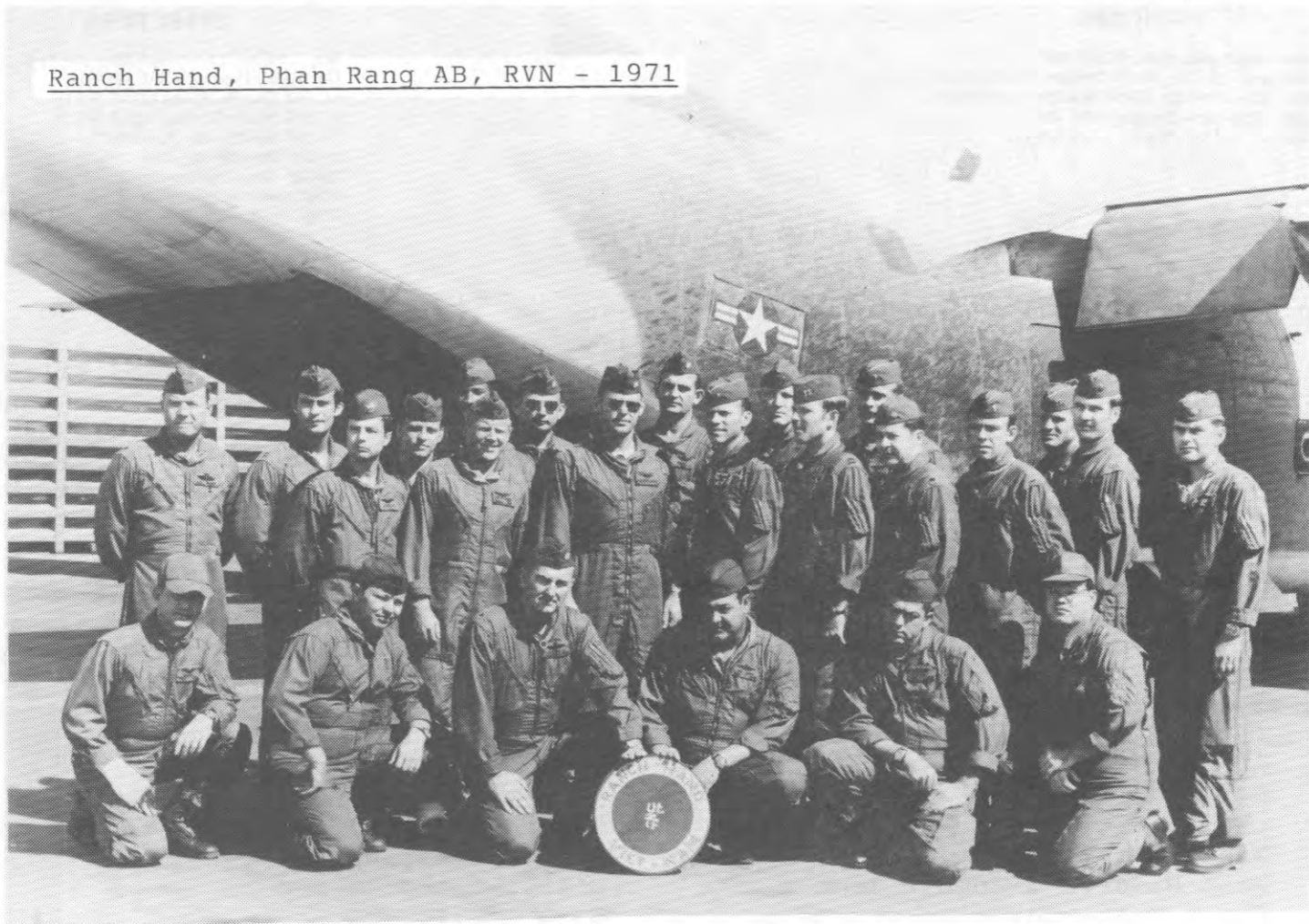
Ranch Hand, Phan Rang AB, RVN - 1971