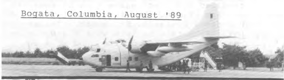
Bogata, Columbia, August '89