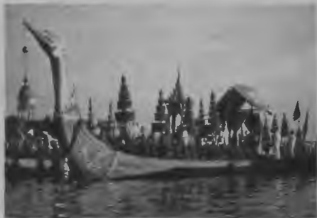
THE ROYAL BARGE SRI SUPHANAHONG