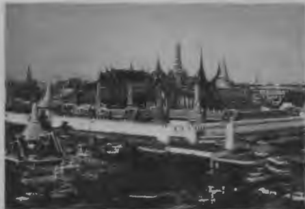
WAT PHRA SI RATTANASATSADARAM