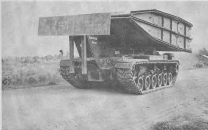
"A Thing of Beauty And Grace"

To a disinterested civilian, the machine might look like a giant bulldozer designed by a modern sculptor and built by the Army. But to the American fighting soldier, the Armored Vehicle Launched Bridge is often the only friend standing between himself and many hours of frustrating hard work.