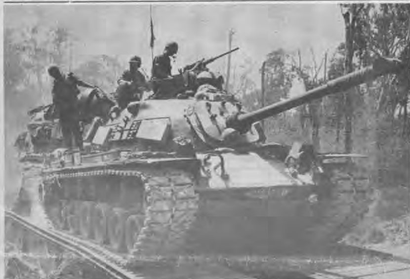
FIRE POWER, MOBILITY, SHOCK EFFECT . . . THE HEART OF ARMOR