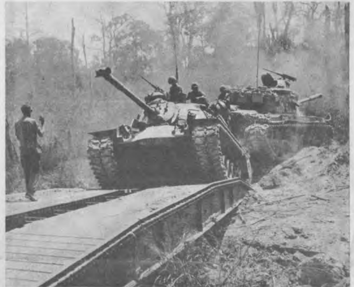
"Over Just A Little—That's It!"