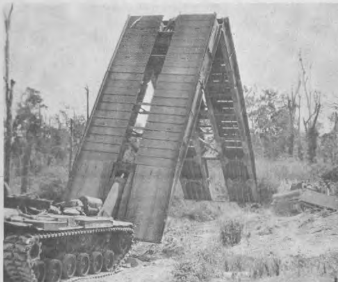
AVLB To The Rescue