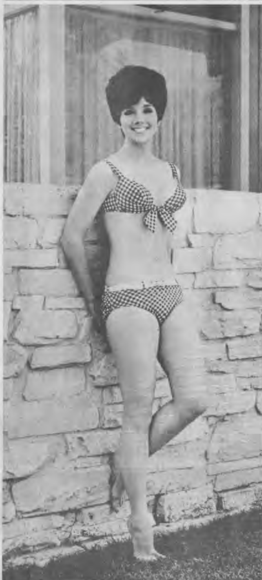
Miss ACAV 1969