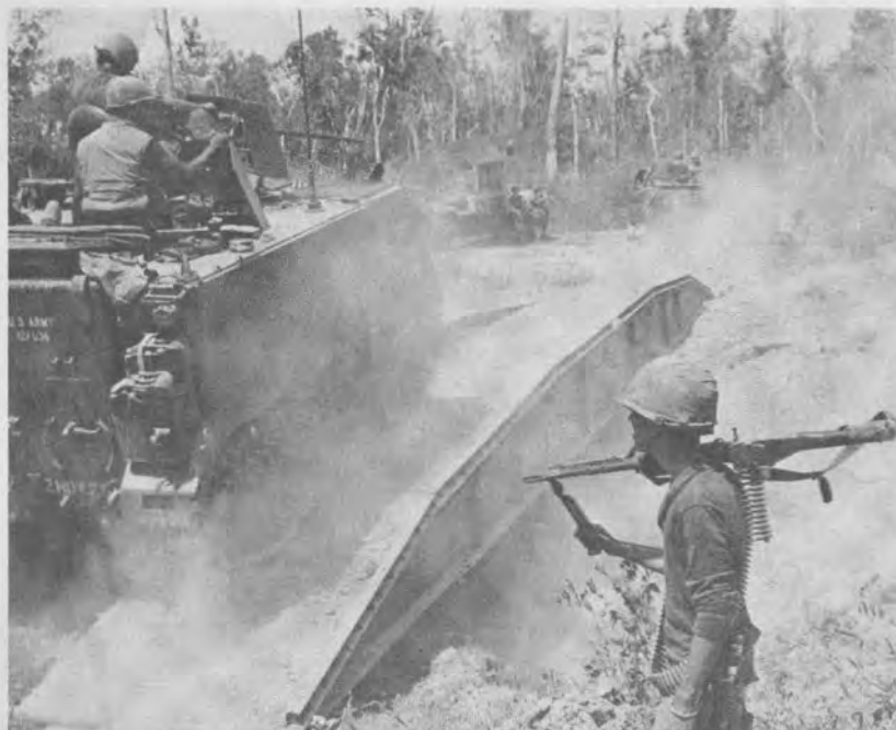
Gee—Can't I ride too?