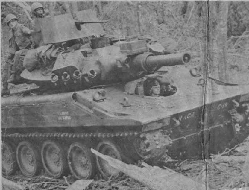
One of the Sheridan's biggest advantages is its increased firepower