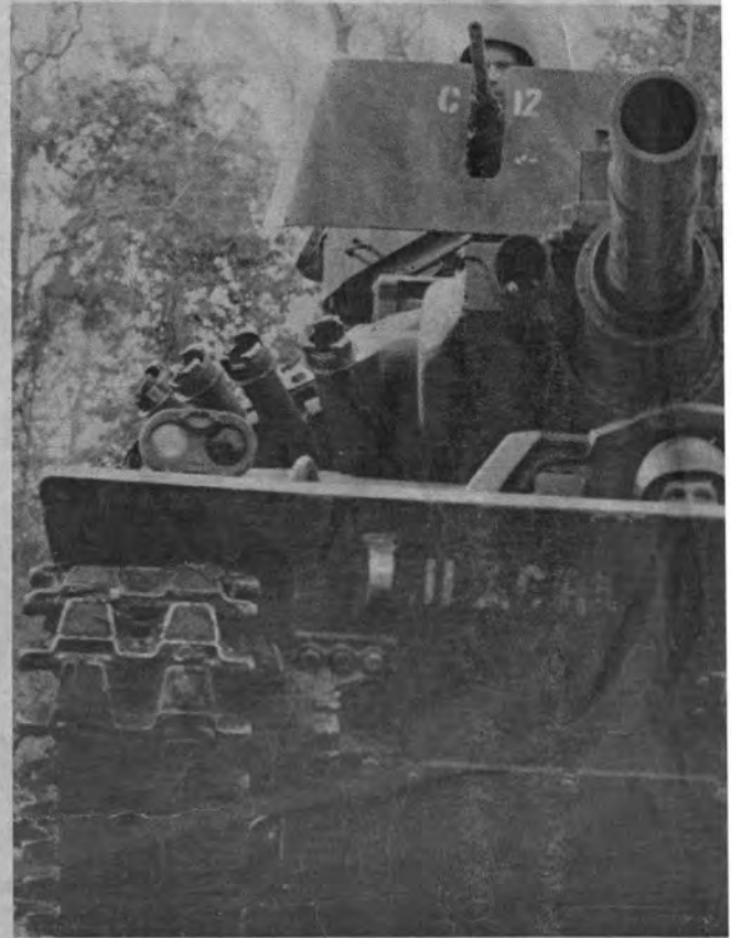
The shape of the Sheridan is known