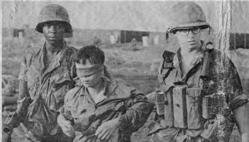
WAR'S END—For this Viet Cong captured by the ARP's. (See story page 11)