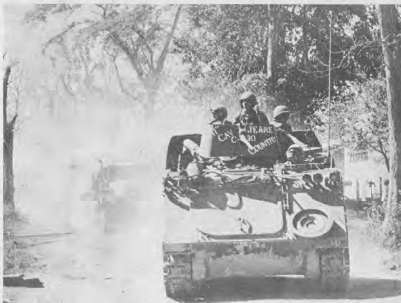
CONVOY ESCORT—A C Troop ACAV rumbles through An Loc toward Quan Loi. The troop has

been escorting the convoys which run several times a week between Lai Khe and the Blackhorse base.