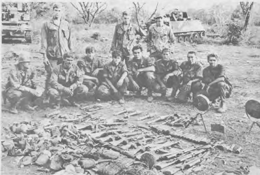
UNCOVER CACHE —Members of 3rd Squadron's I Troop pose with enemy weapons and supplies they uncovered this month near Loc Ninh. It was