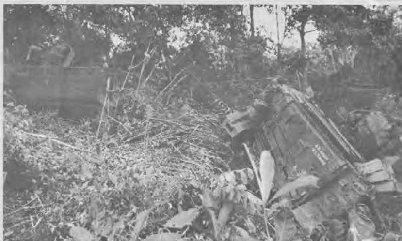
SIDE VIEW —A 2nd Squadron ACAV found the going a little hazardous last month in thick jungle

Maj. Smart's wife and two children reside in Ottumwa, Iowa.