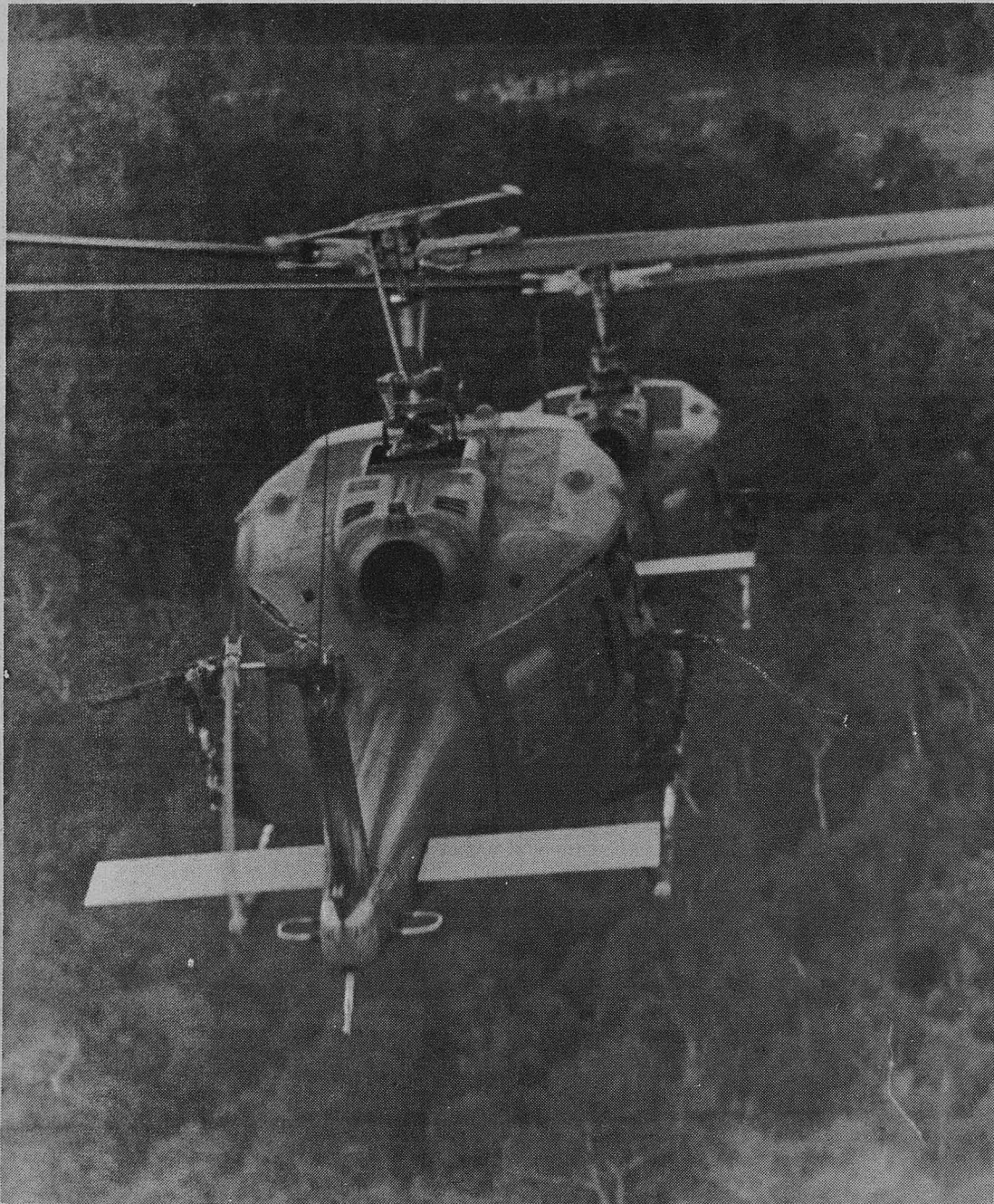
No, it's not a double exposure but a pair of 1st Air Cav Huey helicopters flying piggyback. The choppers are ferrying riflemen from Company D, 1st Battalion, 12th Cavalry, on a combat assault.