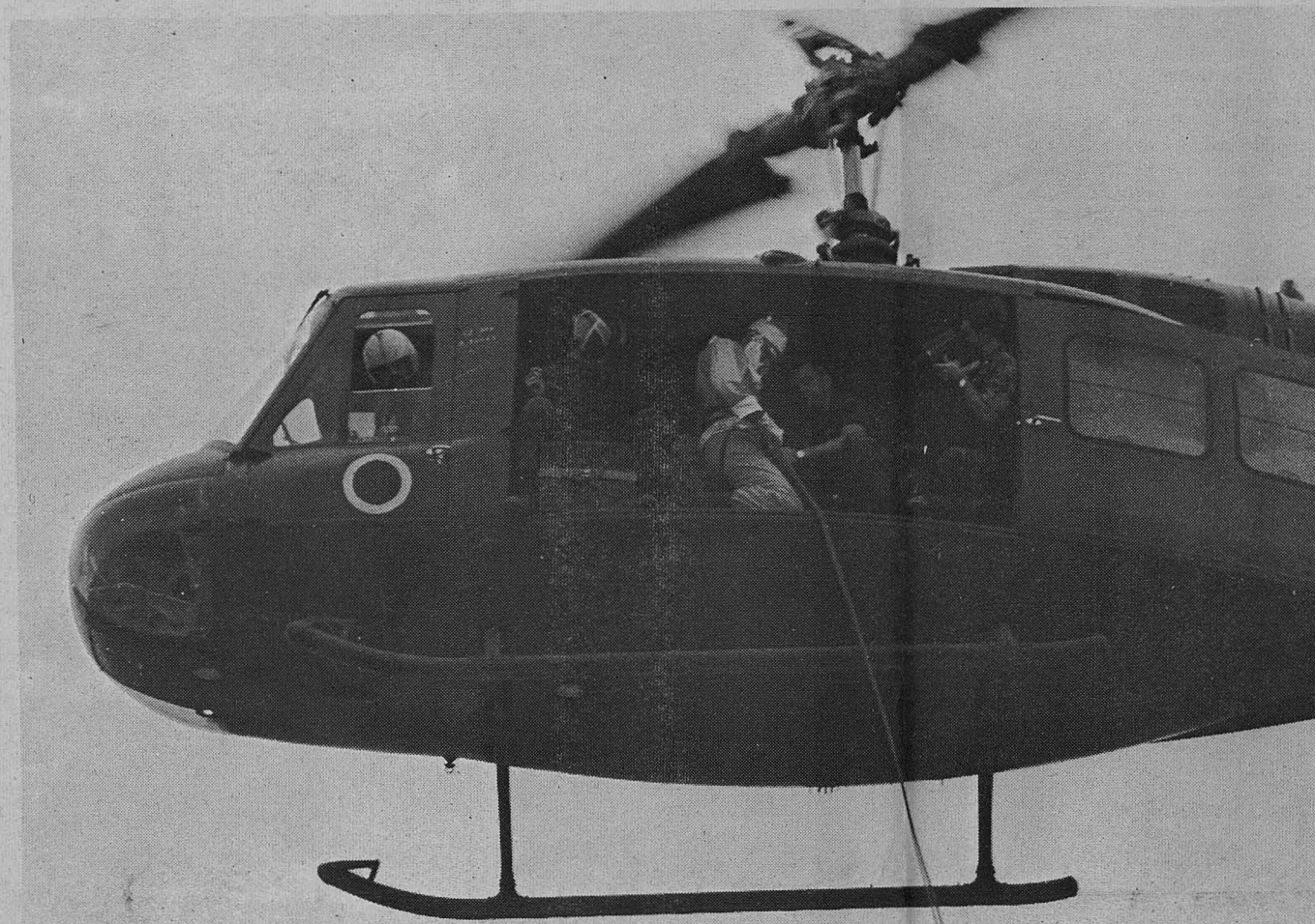
With his UH-1H Huey "sleigh" hovering at 75 feet, Santa prepares for an "airmobile arrival" into Cav Country.