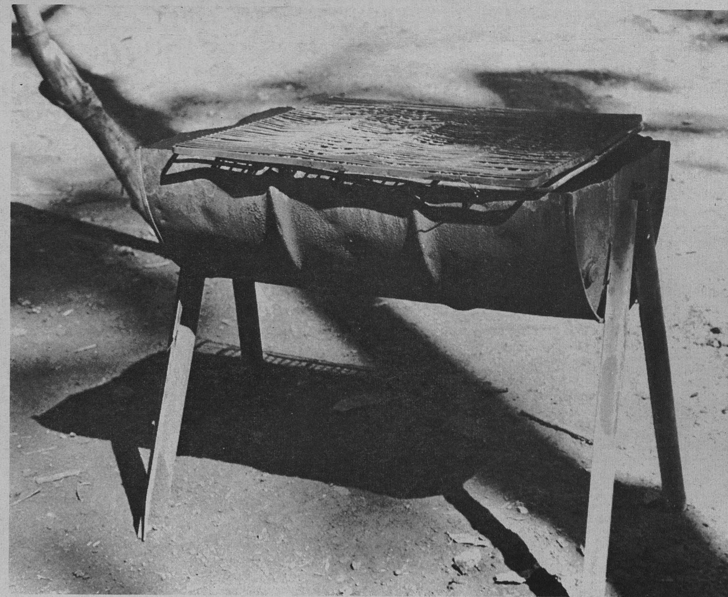
'He became a barbeque pit'