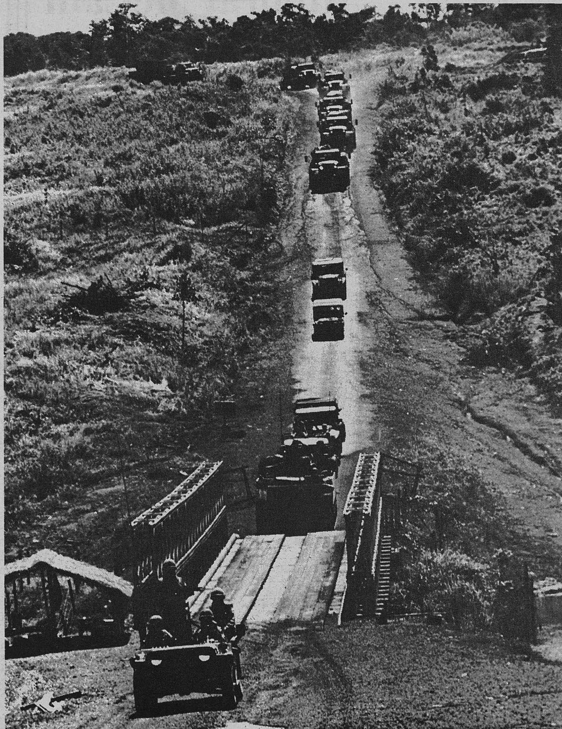
A 2nd Brigade convoy of the 1st Air Cav, escorted by armored personnel carriers with ARVN soldiers pulling security, carries supplies and building materials to Fire Support Base Buttons, home of the Blackhorse Brigade.