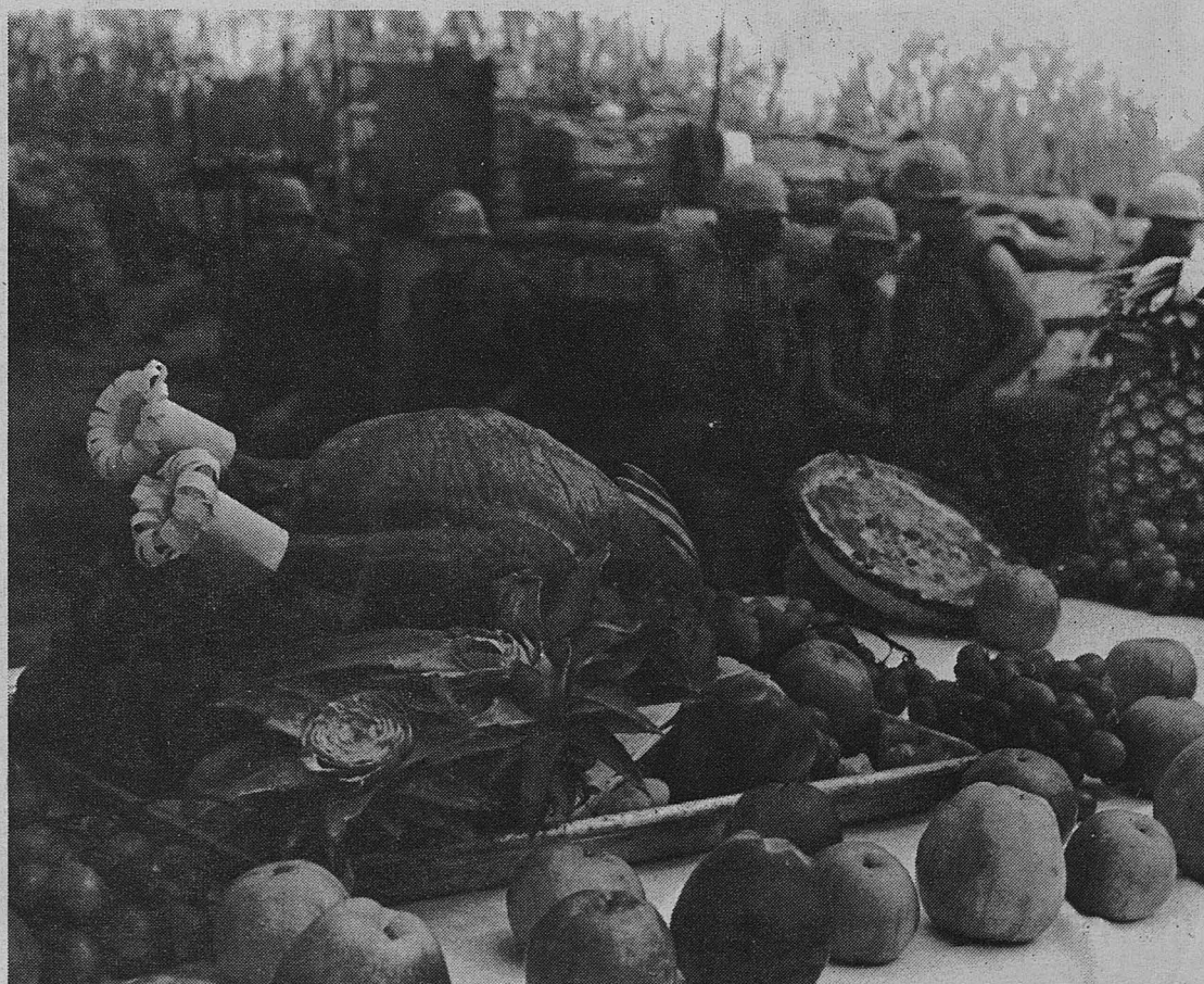
Tom Turkey looks good enough to eat—and that's just what Skytroopers of the 1st Air Cavalry did on Christmas day. Turkey with all the trimmings was served at basecamps and firebases throughout Cav Country.