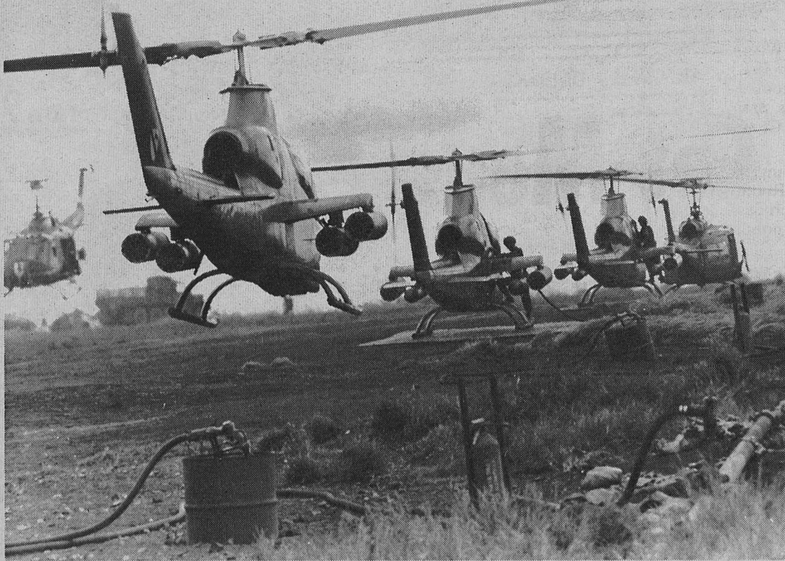
Helicopters line-up at Quan Loi's self-service "gas" station to refuel before taking off on sorties over Cav Country. The station services some 250 helicopters each day.