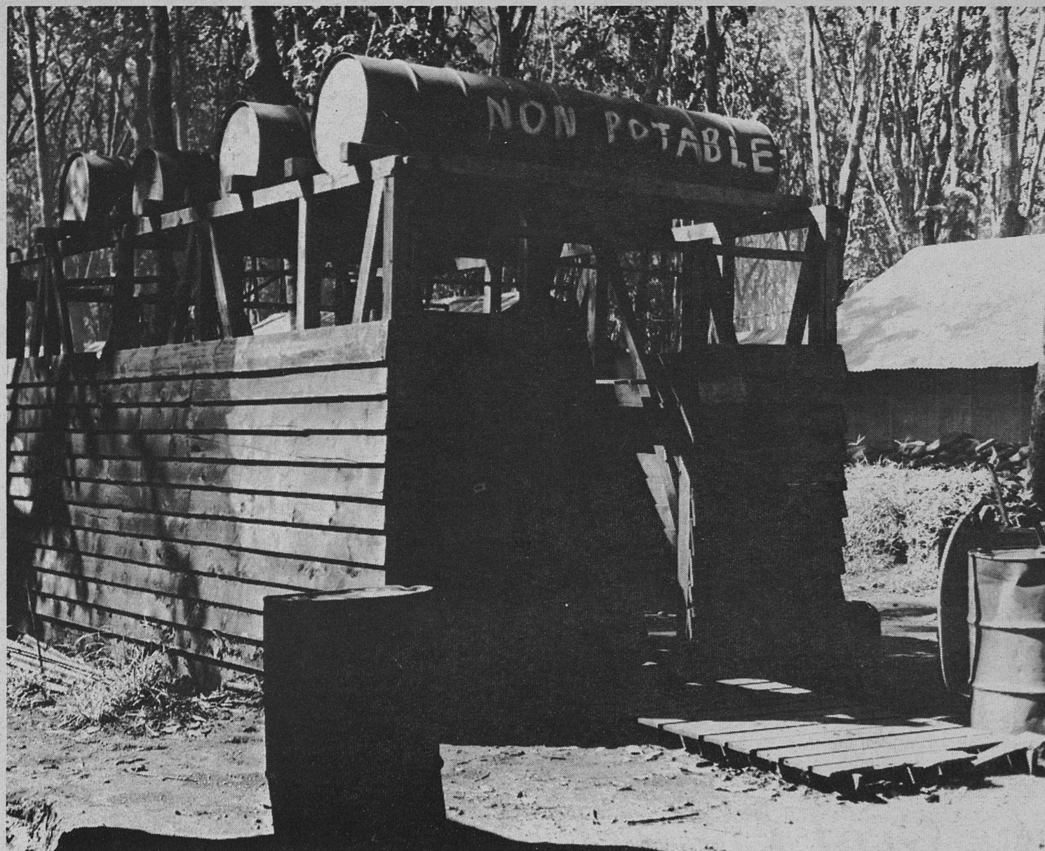
'I was sent to the showers'