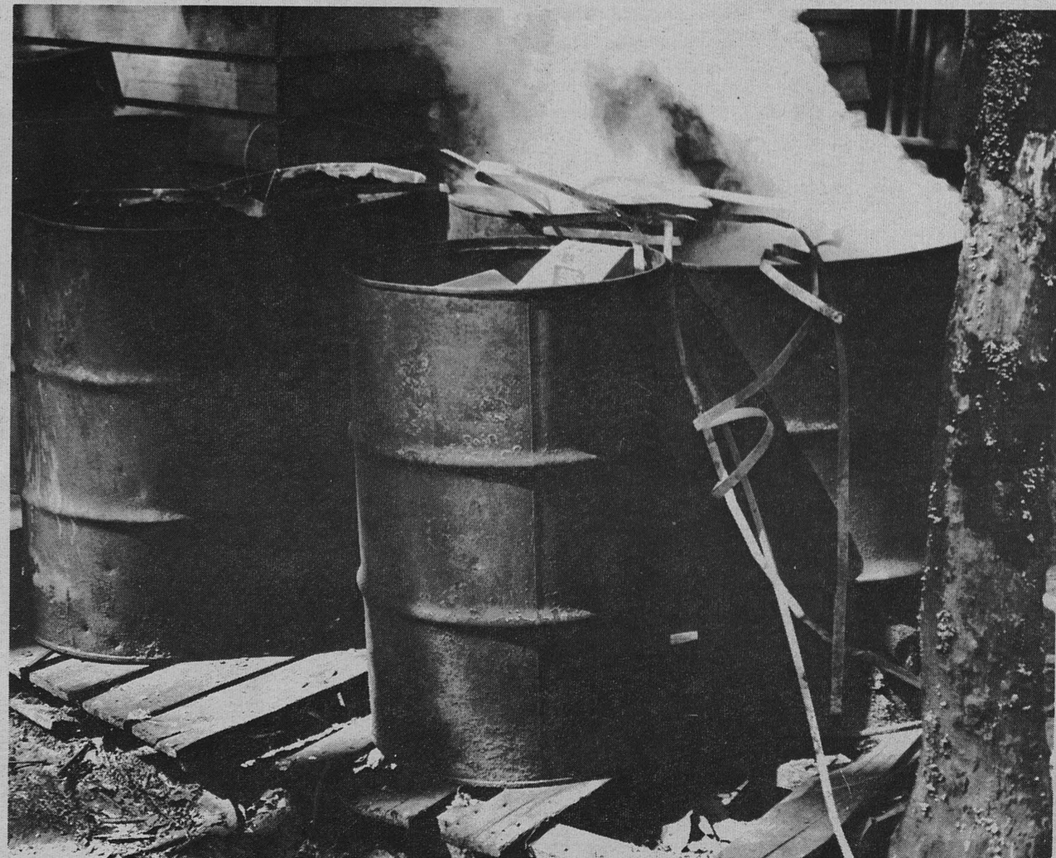
'Other guys burned trash'