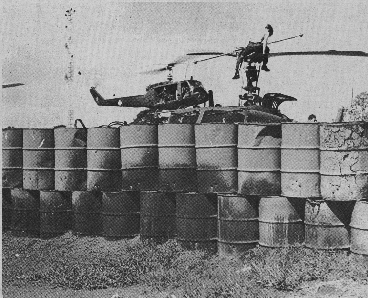
'These buddies showed courage'