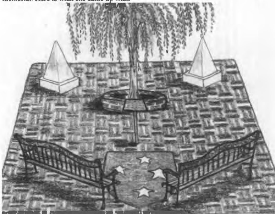
The items in this view are not to scale

Two years ago I asked a local artist to create a rendition of the ideas I have for this memorial. Here is what she came up with.