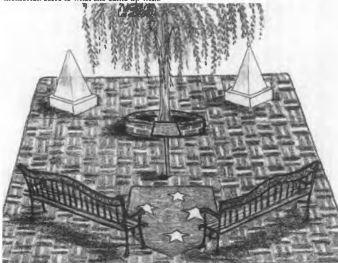
The items in this view are not to scale

Two years ago I asked a local artist to create a rendition of the ideas I have for this memorial. Here is what she came up with.