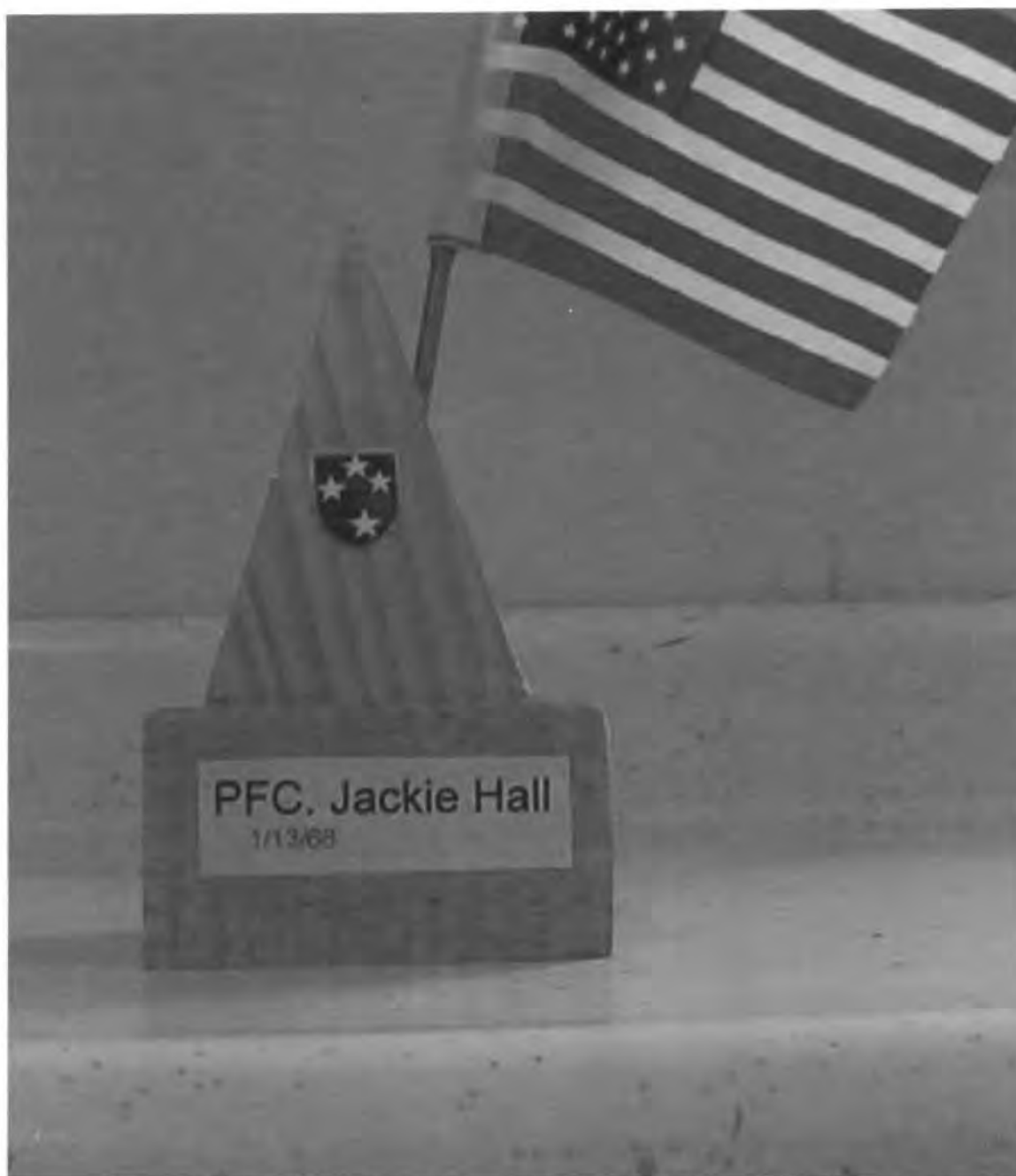
This is a picture of the mementos I brought to Chicago. I left them at the wall a few days later.

There you have it gentlemen. I am committed to this project and will bring it to completion. I would like your support. I would like for you to be here to help Dedicate the memorial in July Of 2008.