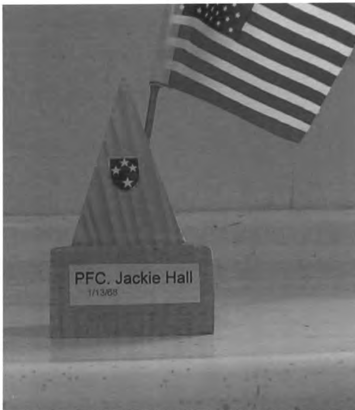
This is a picture of the mementos I brought to Chicago. I left them at the wall a few days later.

There you have it gentlemen. I am committed to this project and will bring it to completion. I would like your support. I would like for you to be here to help Dedicate the memorial in July Of 2008.