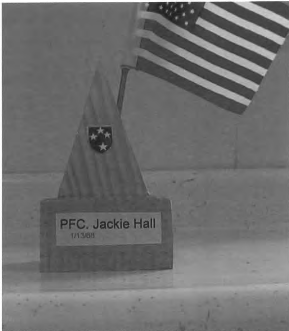
This is a picture of the mementos I brought to Chicago. I left them at the wall a few days later.

There you have it gentlemen. I am committed to this project and will bring it to completion. I would like your support. I would like for you to be here to help Dedicate the memorial in July Of 2008.