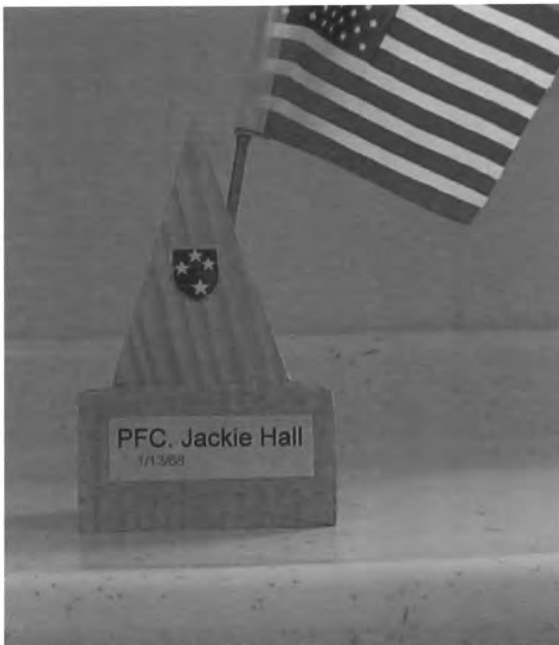
This is a picture of the mementos I brought to Chicago. I left them at the wall a few days later.

There you have it gentlemen. I am committed to this project and will bring it to completion. I would like your support. I would like for you to be here to help Dedicate the memorial in July Of 2008.