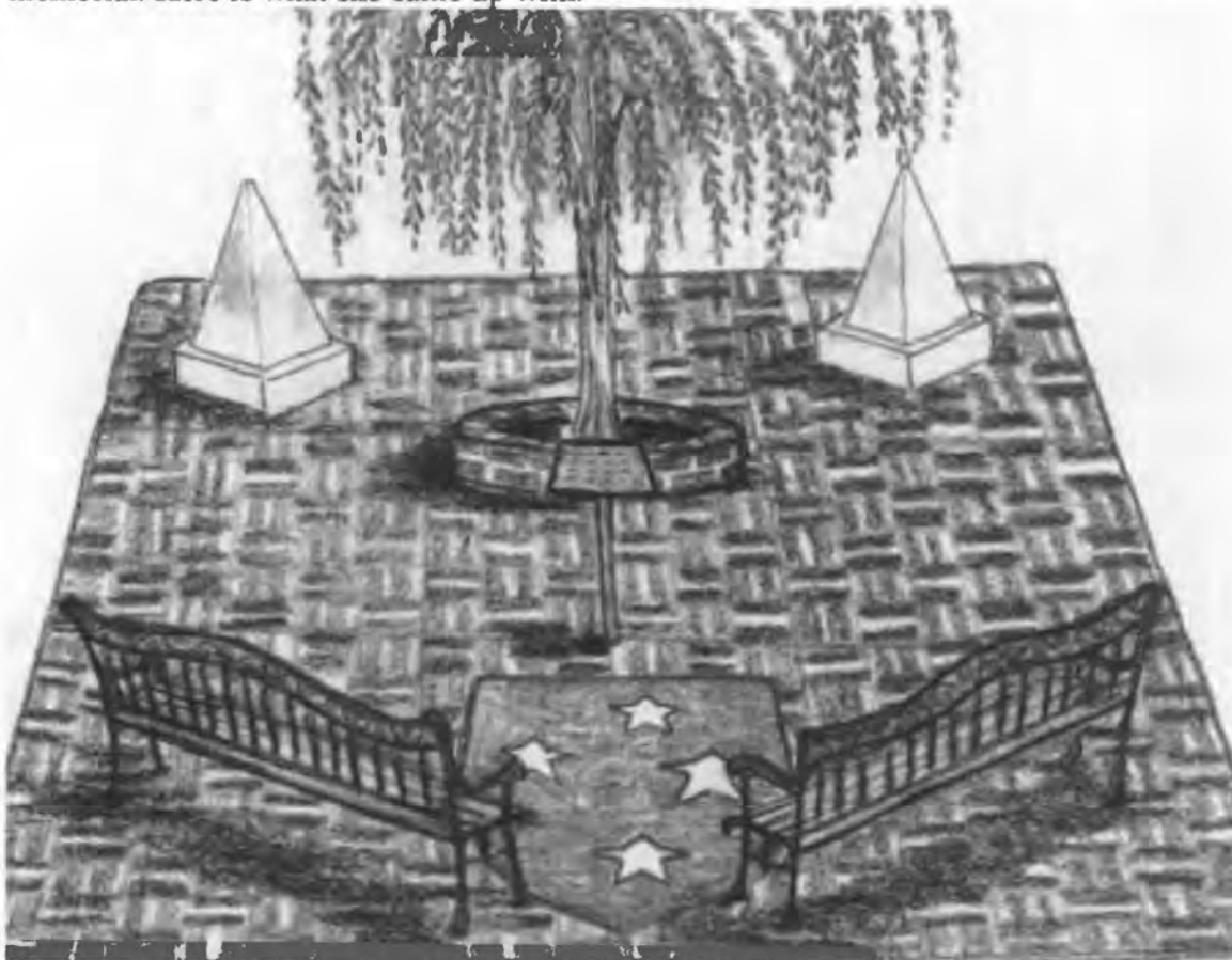
The items in this view are not to scale

Two years ago I asked a local artist to create a rendition of the ideas I have for this memorial. Here is what she came up with.