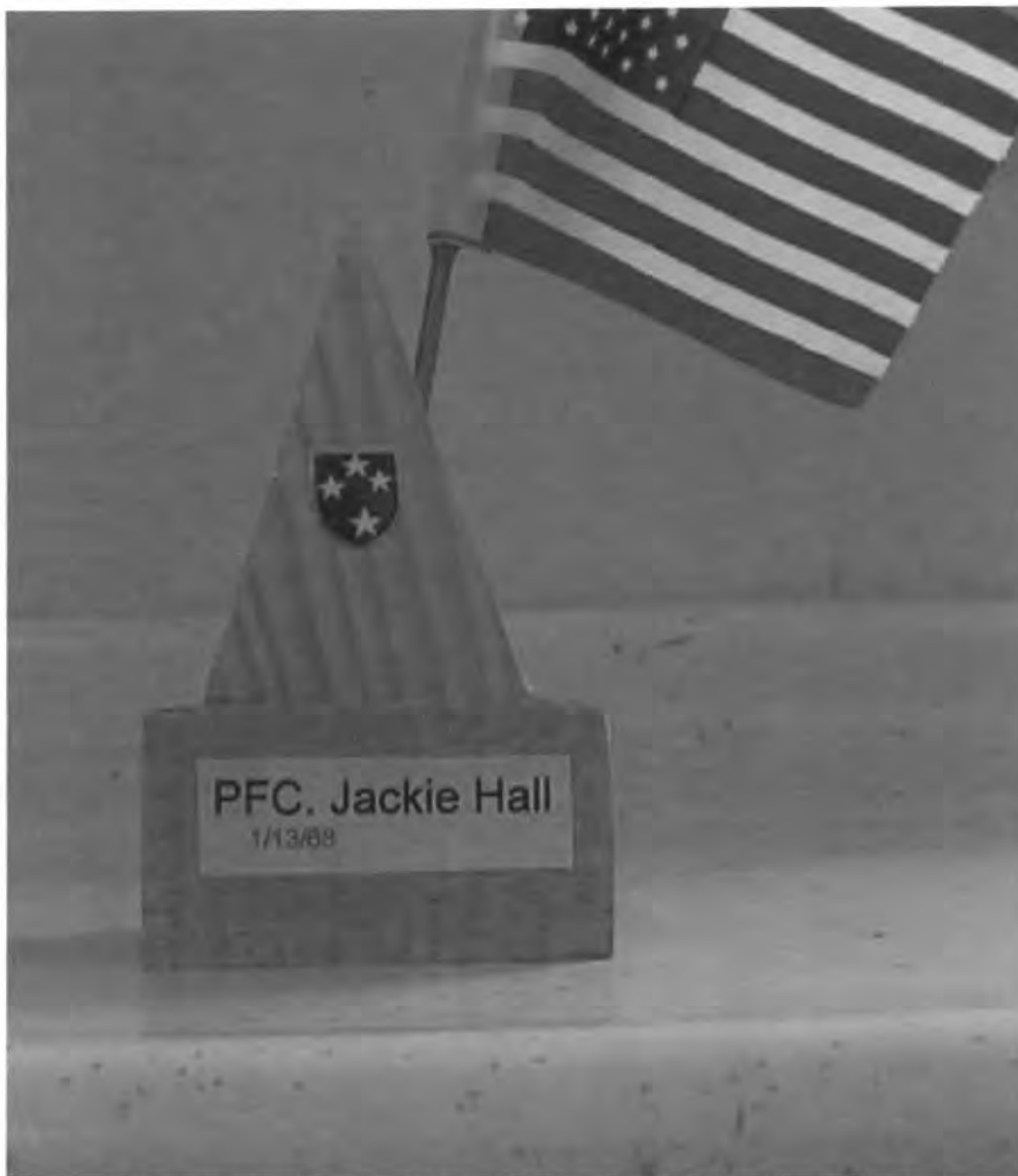
This is a picture of the mementos I brought to Chicago. I left them at the wall a few days later.

There you have it gentlemen. I am committed to this project and will bring it to completion. I would like your support. I would like for you to be here to help Dedicate the memorial in July Of 2008.