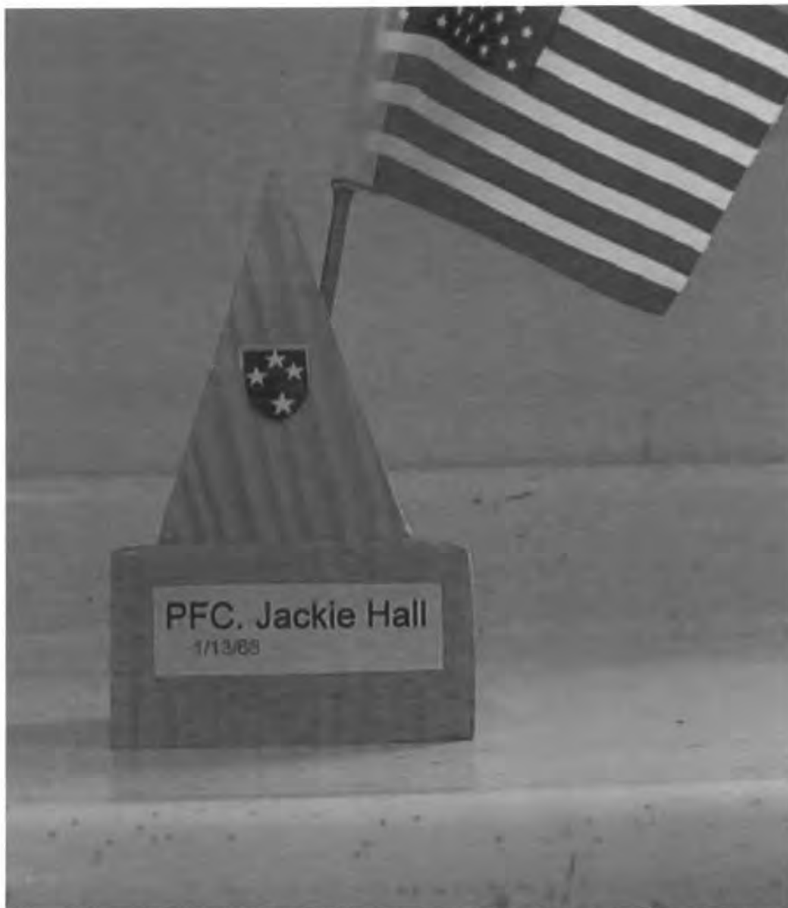
This is a picture of the mementos I brought to Chicago. I left them at the wall a few days later.

There you have it gentlemen. I am committed to this project and will bring it to completion. I would like your support. I would like for you to be here to help Dedicate the memorial in July Of 2008.