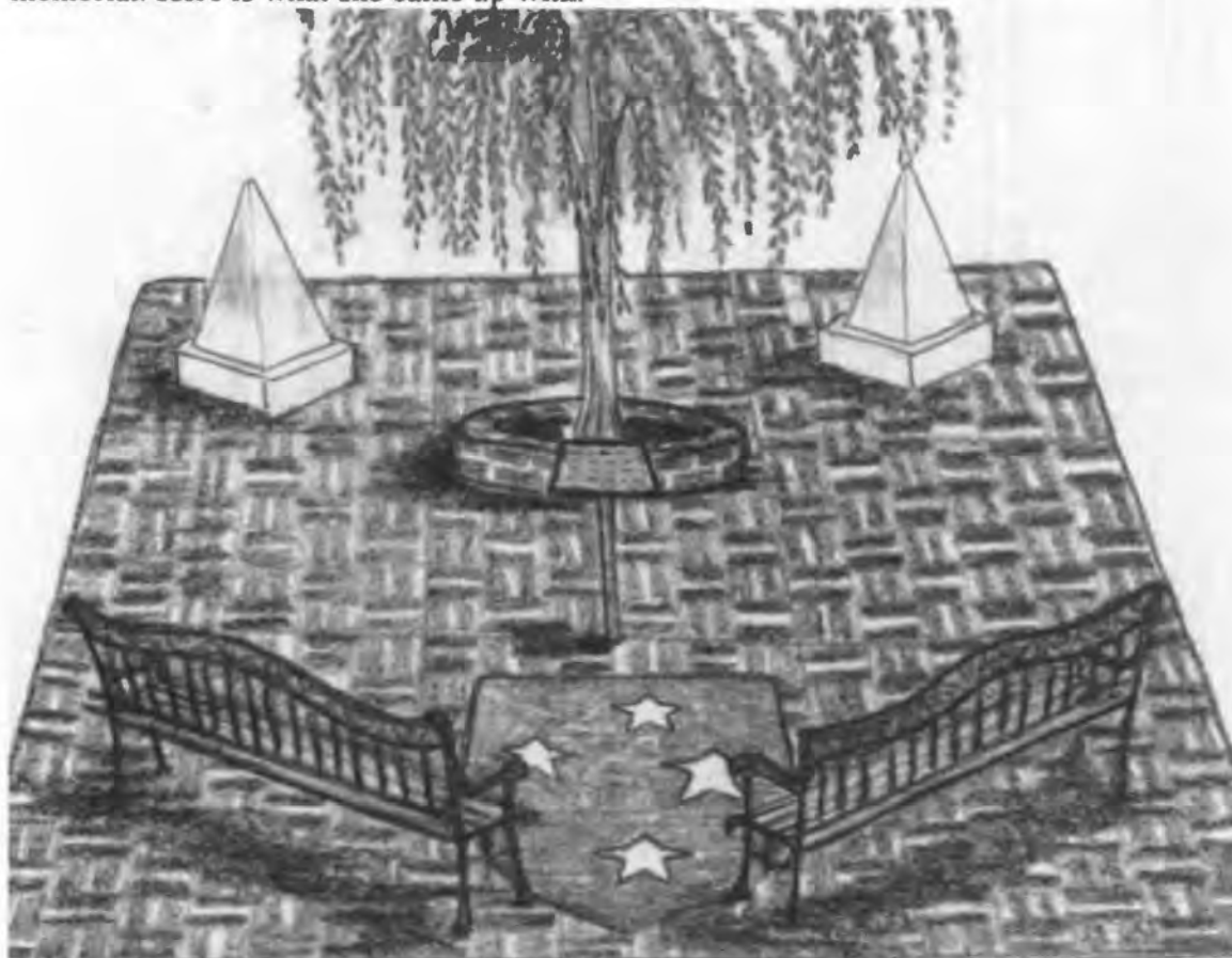
The items in this view are not to scale

Two years ago I asked a local artist to create a rendition of the ideas I have for this memorial. Here is what she came up with.